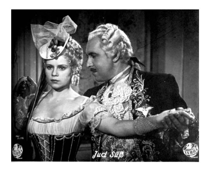
Film still from Jud Süss depicting Dorothea Sturm and Süss Oppenheimer.

Characterizing the Jew as a formless and masked being who could blend into any foreign surrounding obviously presented difficulties for portraying his or her physical appearance. Using cartoon caricatures, the Nazis developed a stereotypical appearance for Jews; the Jew was portrayed as short and stocky, with dark, curly hair, an elongated nose and dark In advertising photographs, the shifty eves. Rothschilds and the Ipelmeyers epitomize this look. In Robert und Bertram's case, caricatures show stereotypical "Jewish" features. However, some of the Jewish characters in this film do not possess the stereotypical look. In particular, the young Jews in Robert und Bertram, namely Lenchen's suitor, Mr. Biedermeier, and Ipelmeyer's daughter, Isadora, are more attractive, Aryan-looking characters (with lighter skin and fitter bodies), suggesting perhaps that the younger generation of Jews is increasingly able to blend into German society.