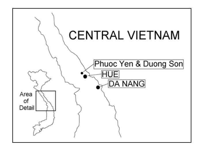
Map A. Central Vietnam.

population of Phuoc Yen is comprised of almost thirty different family lineages, but it is still commonplace to hear people refer to the thap nhi ton phai (twelve founding families) who were the first Viets to live and cultivate wet rice on this narrow flood plain north of the imperial city of Hue (see Map A).