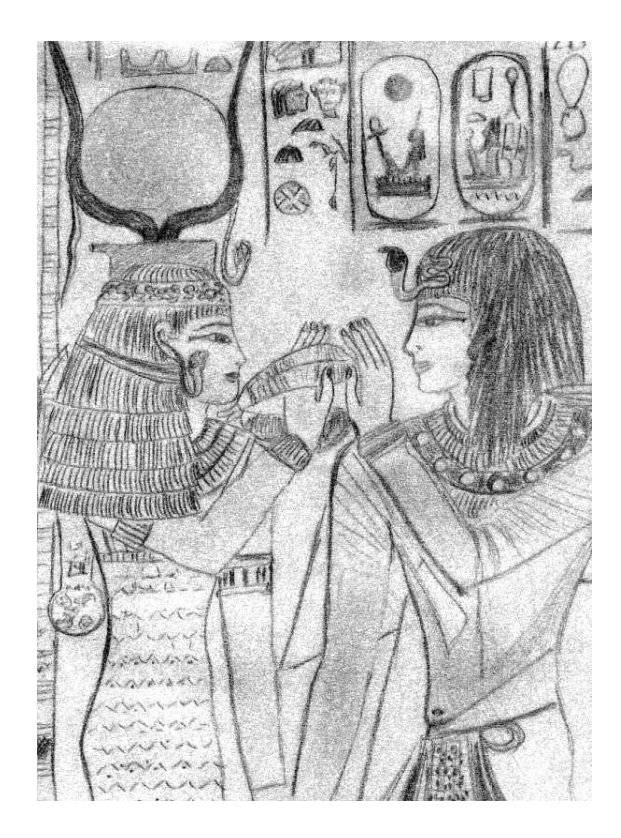
Figure 1. Hathor and Seti I. After a bas-relief in the Louvre Museum, Paris. Illustration, Eve Millar.

These living animals were envisioned as providing a direct link between the Pharaohs and the gods. In Memphis, Hathor's earthly representatives were white cows kept and milked in the goddess' temple for the purpose of feeding this 'divine' milk to the Pharaoh's babies. Here Hathor's head is carved into capitals, her face flanked by cow's ears. The idea of having sacred cows attached to temples was not restricted to Egypt; temple dairies also existed in Sumer and thrive in India today. The cow goddess Hathor, an ancient pre-dynastic goddess, gradually assumed many roles over time; she combined both maternal cow goddess and creative sky goddess duties with roles as earthly queen, guardian of the dead and protector of kings.