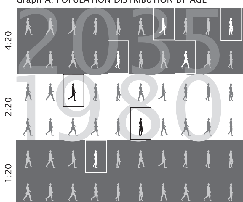
Graph A: POPULATION DISTRIBUTION BY AGE

Fifteen years ago, the traditional players in making pension policy business, labour and government were fighting over how retirement income should be structured to meet the shortcomings of company sponsored pension plans. Other groups with a large stake in the final outcome also entered the debate on the basis of a different set of priorities. Women's advocates were most visible, but also were joined by senior citizens groups and social welfare organizations. In many ways, however, the parameters of the debate had already been defined. The four tiers of the pension system establish a state enforced hierarchy between the interests of private profit and public benefit; between earners and non-earners; and between universal programs designed to promote equality, and individualized programs designed to promote initiative.