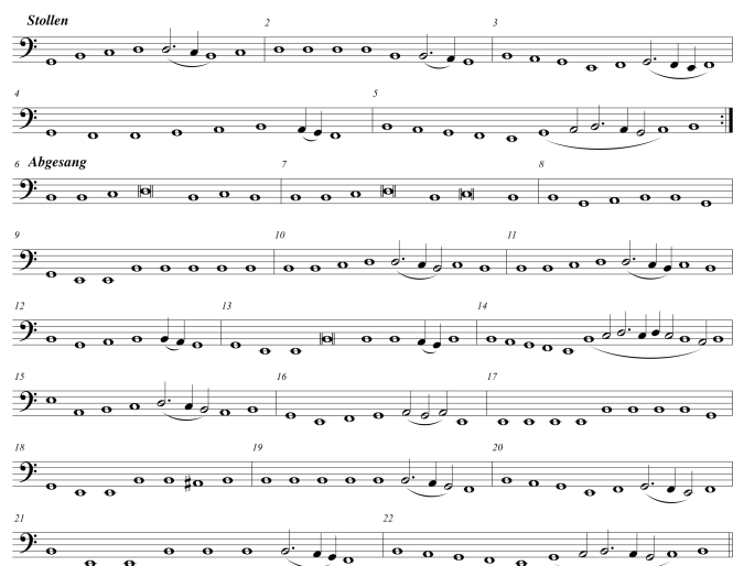
Figure 1: Morgenweise 18

Both of these Meistergesang also exhibit a clear articulation of phrase endings, aiding a clear declamation of the text. While made apparent through the fermatas found at the end of each phrase, this is also inherent in the shape of the melodic line.