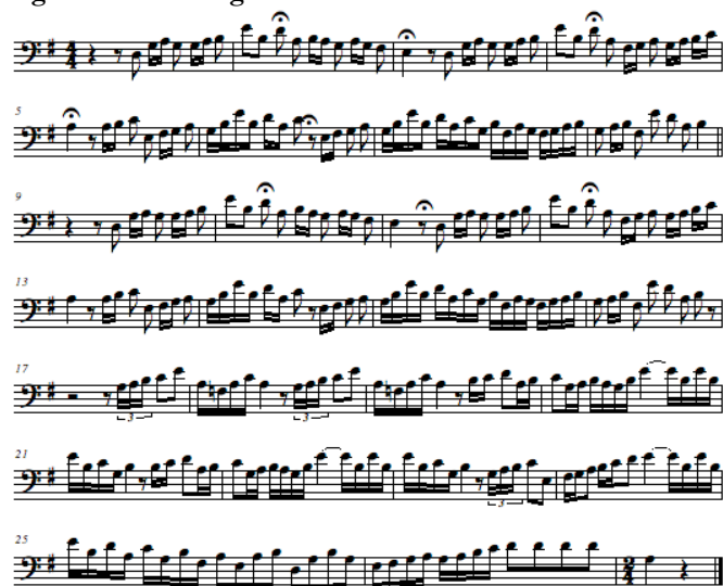
Figure 5: "Den Tag"

There are some divergences from traditional Meisterlied in Beckmesser's two songs. Both feature an