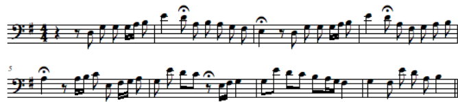
Figure 6: Stollen 1 of “Den Tag” reduction

Repetition also forms an important component of Beckmesser’s songs, if not to the same density of Sachs’ Meistergesang . Repetition found in “Den Tag” is reminiscent of that found in the Stollen and Abgesang of Silberweise . Unlike traditional Meistergesang , there is no direct repetition between the Stollen and Abgesang that serves a unifying function in Beckmesser’s songs. However, the repetitive nature of the coloratura, which is always based on the descending fourth, connects the two halves of the piece into a unified whole.