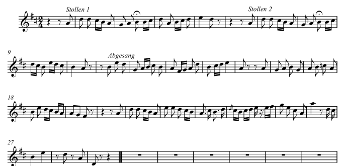
Figure 8: "Johannessprüchlein"

It is clear from this analysis that Beckmesser is closer to the traditions of historical Meistergesang than Walther. His music eschews the chromatic, developmental nature of Walther's pieces and mimics the clear phrases, melodic simplicity, and repetitive nature of Morgenweise and Silberweise . This is not to say that Beckmesser's songs are more artistically valid than Walther's. Meistergesang , though glorified by Wagner and other artists of the nineteenth-century, was recognized as a tradition in which "obedience to the rules" led to a "paucity of good Meisterlieder." 26 Wagner seems to support this negative view of Meistergesang . After all, Sachs and Walther are presented as the heroes of the opera, not Beckmesser and his more historically accurate songs. Combined with Beckmesser's satiric presentation, Wagner appears to deride Meistergesang throughout the opera by making it the symbol of a pedantic antagonist.