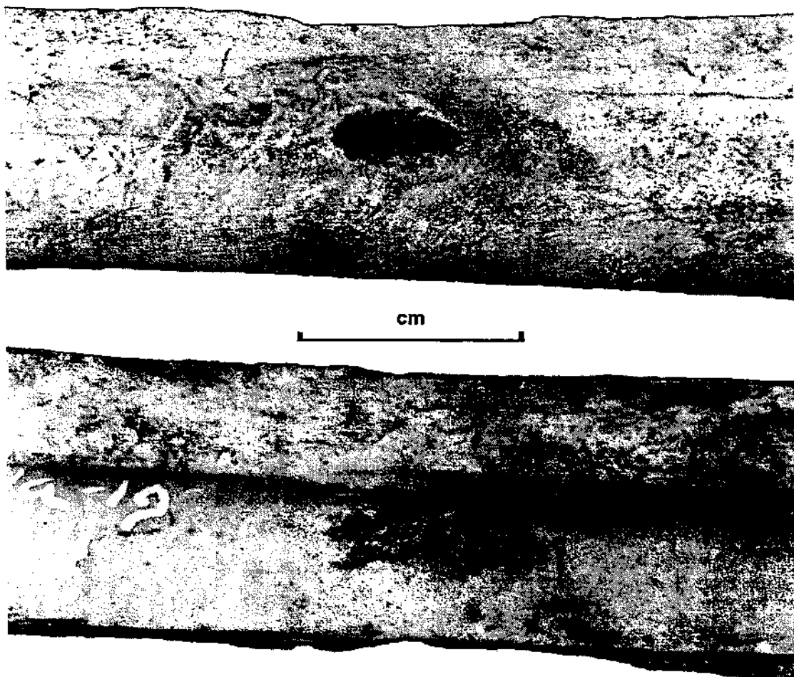
Figure 2. Closer view of injury. Above - exterior surface. Below - interior surface.