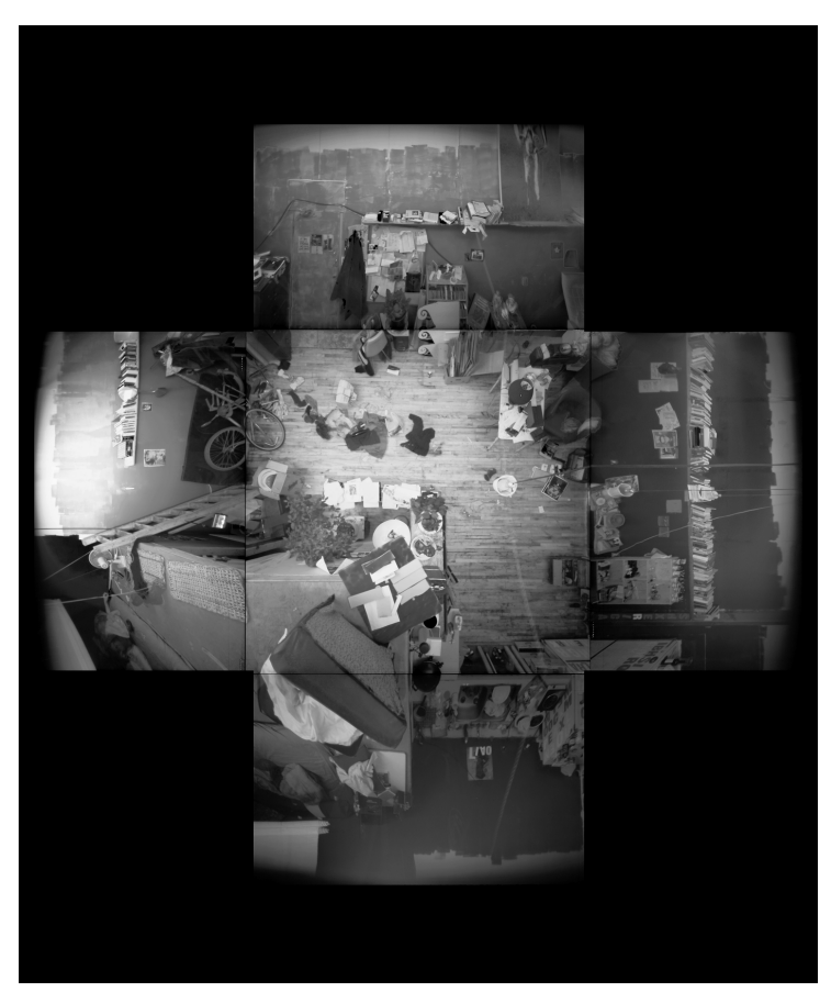
Evicted May 1, 2000 (9 Hanna Ave.), 13 colour pinhole photos, 20x24" and 24" x 30", 2001, photos: Adrian Blackwell. Copyright Adrian Blackwell. Photo 4 - Darren O'Donnel's Space