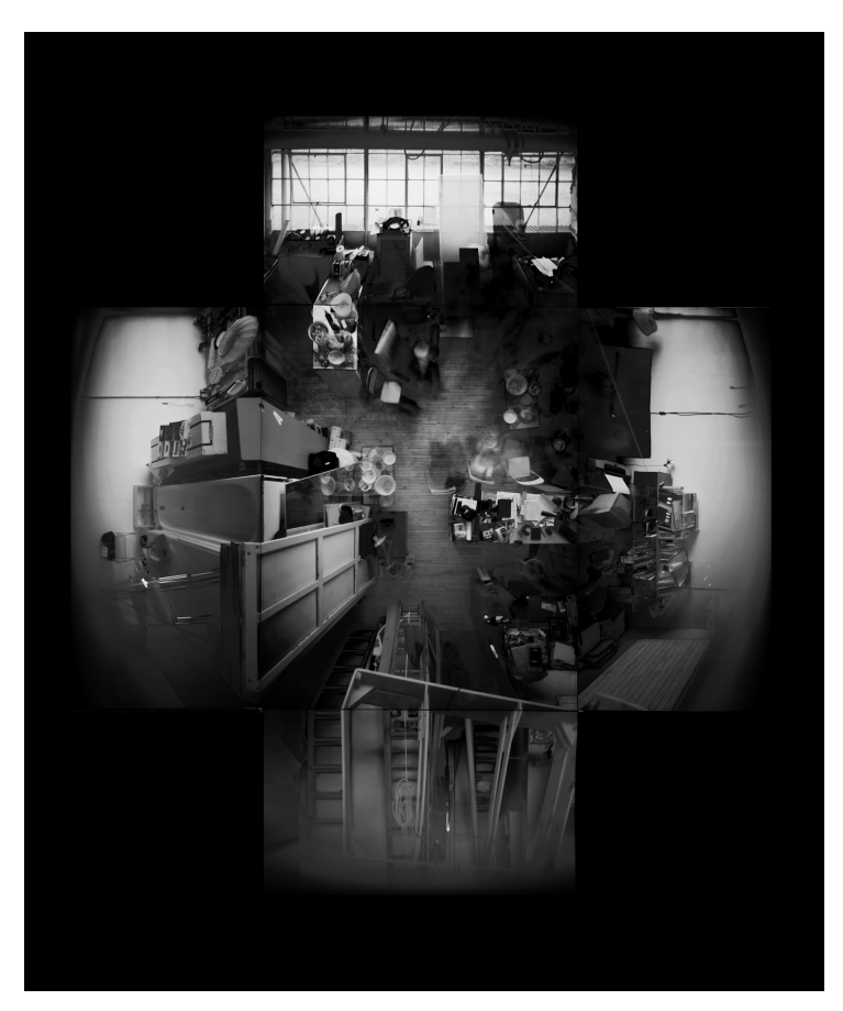
Evicted May 1, 2000 (9 Hanna Ave.), 13 colour pinhole photos, 20x24" and 24" x 30", 2001, photos: Adrian Blackwell. Copyright Adrian Blackwell. Photo 2- Adrian Blackwell's Space

confines of capitalism's cultural institutions. This aesthetic of tension is constantly searching for avenues that break out of alienation, transparencies that bridge the gap between artist and audience, ruptures that draw us into contested social ground, where we discover our own freedom.