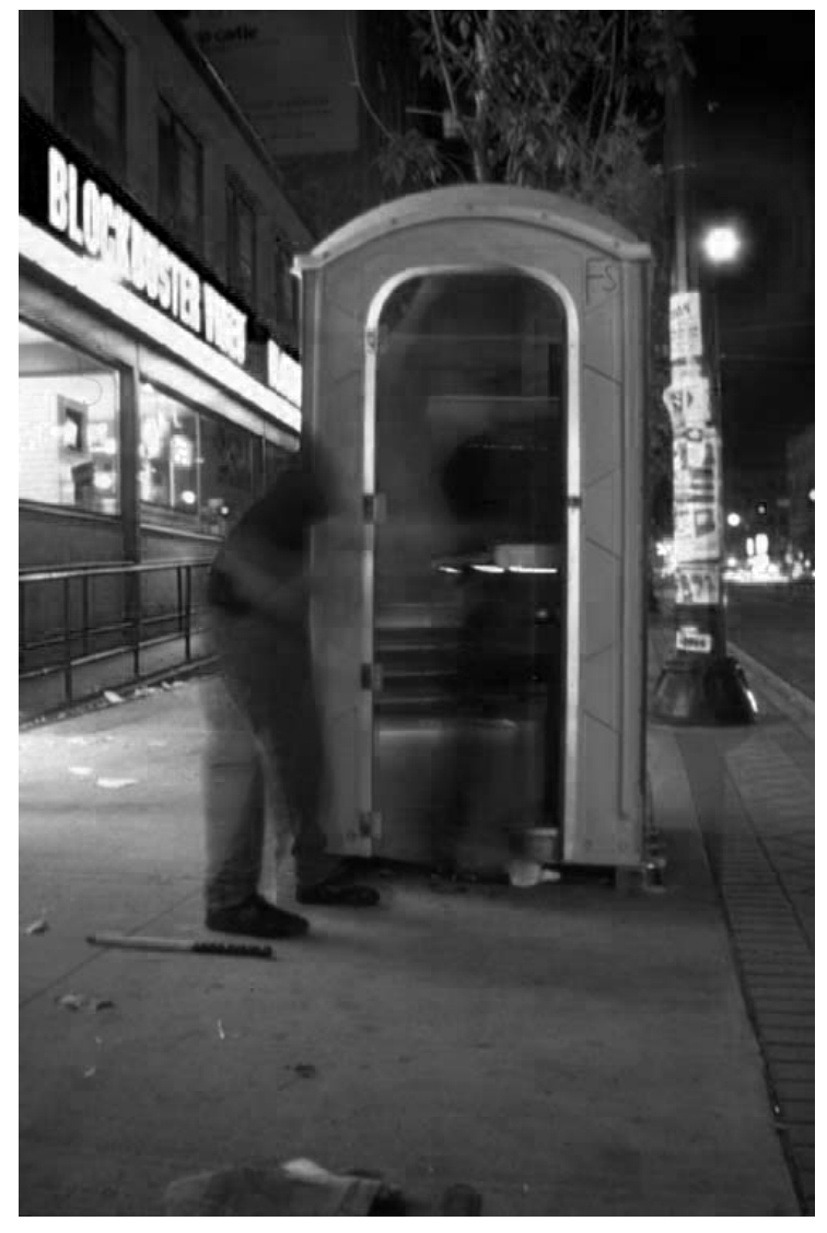
Public Water Closet, modified portable toilet, 2-way mirror glass (Ottawa and Toronto) 1998

the production of architecture is "highly mediated [\ldots] within the collaborative yet hierarchical structure of a firm" while art is "generated in a context that is proximate to the everyday lives of its