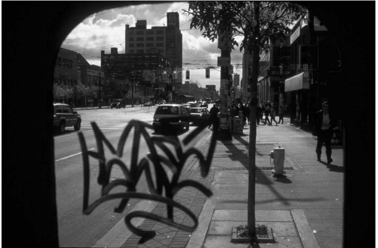
Public Water Closet, modified portable toilet, 2-way mirror glass (Ottawa and Toronto) 1998

producers" (Blackwell, 2005: 78). Architects build the environments we live in, but the creative freedom of the architect is systemically constrained. How, then, can one radicalize the social potential of architecture? Blackwell's solution has been to incorporate architectural concerns into art-making, prefiguring anarchic social relationships in the guise of art that takes aim at the popular culture of