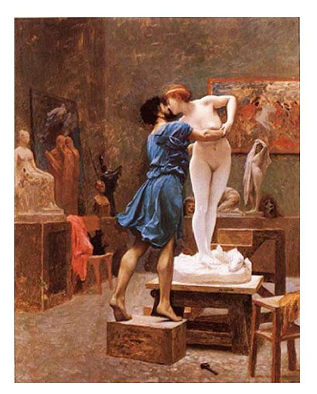
Figure 2 Jean-Léon Gérôme, Pygmalion and Galatea , 1865–70

Why is that? If democracy is supposed to mean the ability to participate in the decisions that affect your life, then being able to vote — to choose between A and B — is the false version of this decision-making, since the very option between A and B on your ballot was a decision made beforehand, over which the voter has no choice. In Canada you vote between Liberals and Conservatives; in the U.S. you choose between Republicans and Democrats. For anarchists, however, "making a choice" is not the same as "making a decision". This is so because making a decision is a creative act, the result of which is to produce the options in terms of which choices are made.