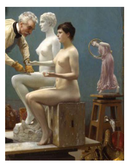
Figure 4 Jean-Léon Gérôme, Working in Marble (detail view), 1890; Dahesh Art Museum of Art

the mode of its freedom, Life no longer and also not yet subject to the forces that construct reality merely as a series of choices, thoughts performed in a default setting, and canned laughter. It's perfectly appropriate that Life in the process of its becoming should assume the form of a dancer, whose gestures disappear the moment they appear. But the dancer on the canvas is a strange figure, paradoxical, and suffused with ambiguity. This dancer is represented as a sculpture — as an object immobile, incapable of dancing, no longer in the mode of becoming — a sculpture depicted, in turn, as oil paints on canvas, upon the illusionistic surface of an Academic painting. This ambiguous nature of the open hole is articulated — is spelled out — in the three intertwined figures: the sculpture that is also a model that is also an artist, though simultaneously it cannot be an artist, because it cannot be a model, because it cannot be a sculpture — because this grouping is, in actuality, a picture.