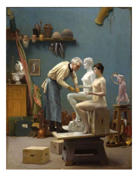
Figure 3 Jean-Léon Gérôme, Working in Marble , 1890; Dahesh Art Museum of Art

life and death do not occupy the same body, as in Galatea's body, but a gap separates the two. The difference between life and death, though represented as a clear difference between two distinct bodies, appears nonetheless as a surrealistic difference, as an uncanny mirroring, repetition, or act of camouflage. The three figures — model, artist, and sculpture — are here placed on equal footing and share the space of the same pedestal. Already this marks a significant departure from the previous painting. And notice: the little sculpture in the background has morphed from an image of feminine seduction, in Pygmalion and Galatea, to one that here I would describe as an image of the experience of groundlessness. A dancer crosses the empty space of the hoop she is holding and, like Alice in Wonderland about cross the looking-glass, the dancer seems to be discovering a new reality on the other side of the round hole, a reality where model, artist and sculpture are intertwined, and exist as distinct bodies placed on equal footing to create a single grouping. Gérôme's earlier Pygmalion and Galatea appears on this canvas as well, as a small reproduction pinned to the wall on the left, offering a point of contrast to this new narrative where, to my eyes, different desires are represented.