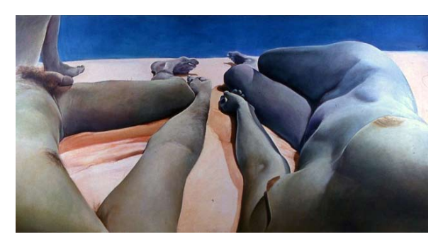
Figure 5 Joan Semmel, Intimacy-Autonomy , 1974; oil on canvas; Brooklyn Museum, image courtesy of the artist

I often wonder why it is that we look at pictures — why at times we turn towards fictions in order to conceive something true. There are two pictures that I can see hanging at the entrance of Smithson's Museum of the Void. One of them is a painting by Joan Semmel, titled Intimacy-Autonomy , 1974 (Fig. 5).