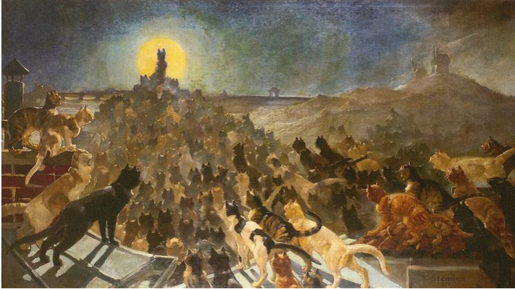
Theodore Steinlen, Apotheosis of the Cats of Montmartre, 1889/90 oil on canvas, 164.5 x 300 cm