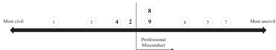
Figure 1 : A spectrum analysis of the LSUC Decision 27