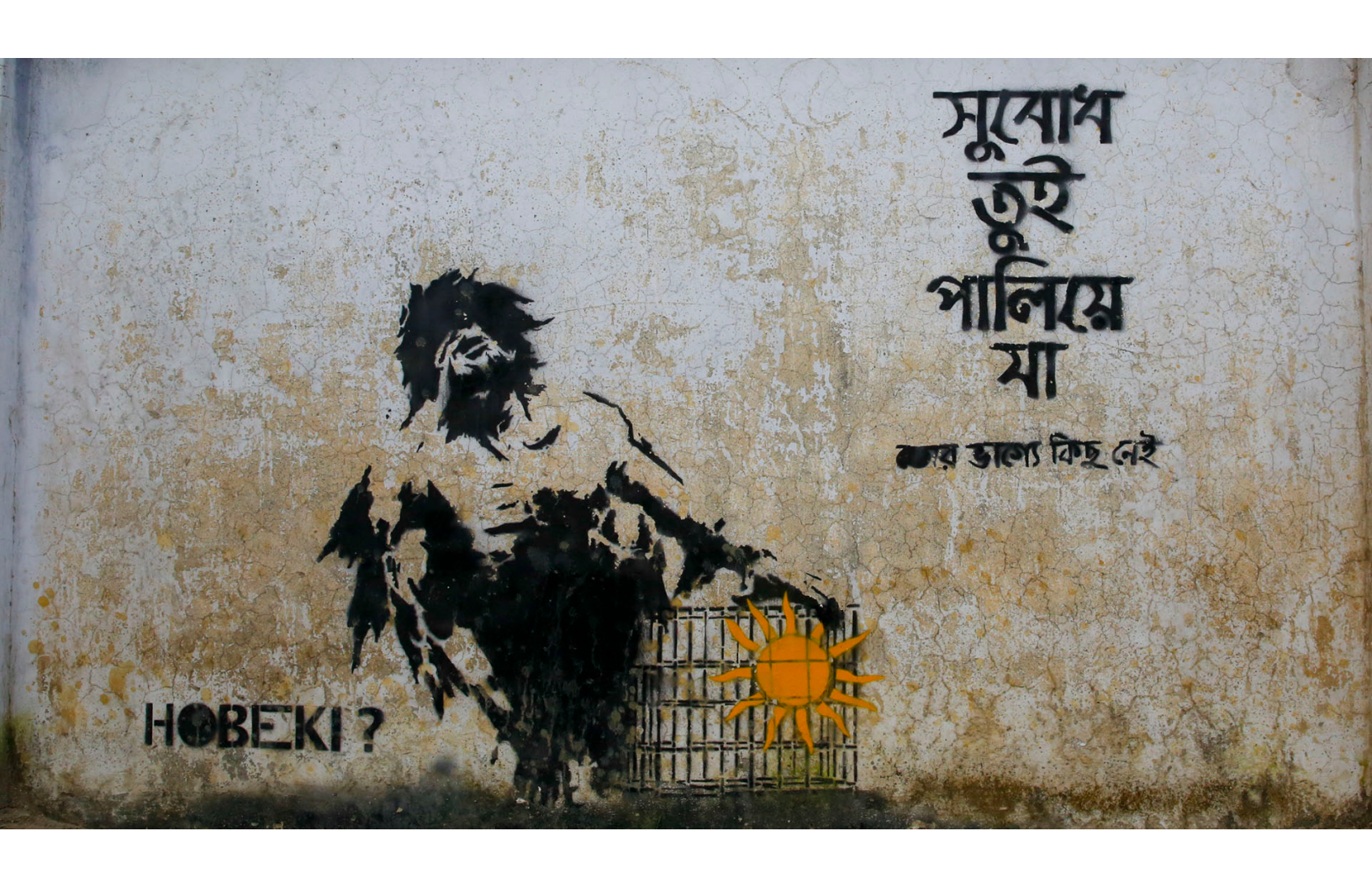
FIGURE 1 HOBEKI? "Run away Subodh, there is nothing for you here," 2017. Old Airport, Agargaon Mohakhali link road, Dhaka, Bangladesh.