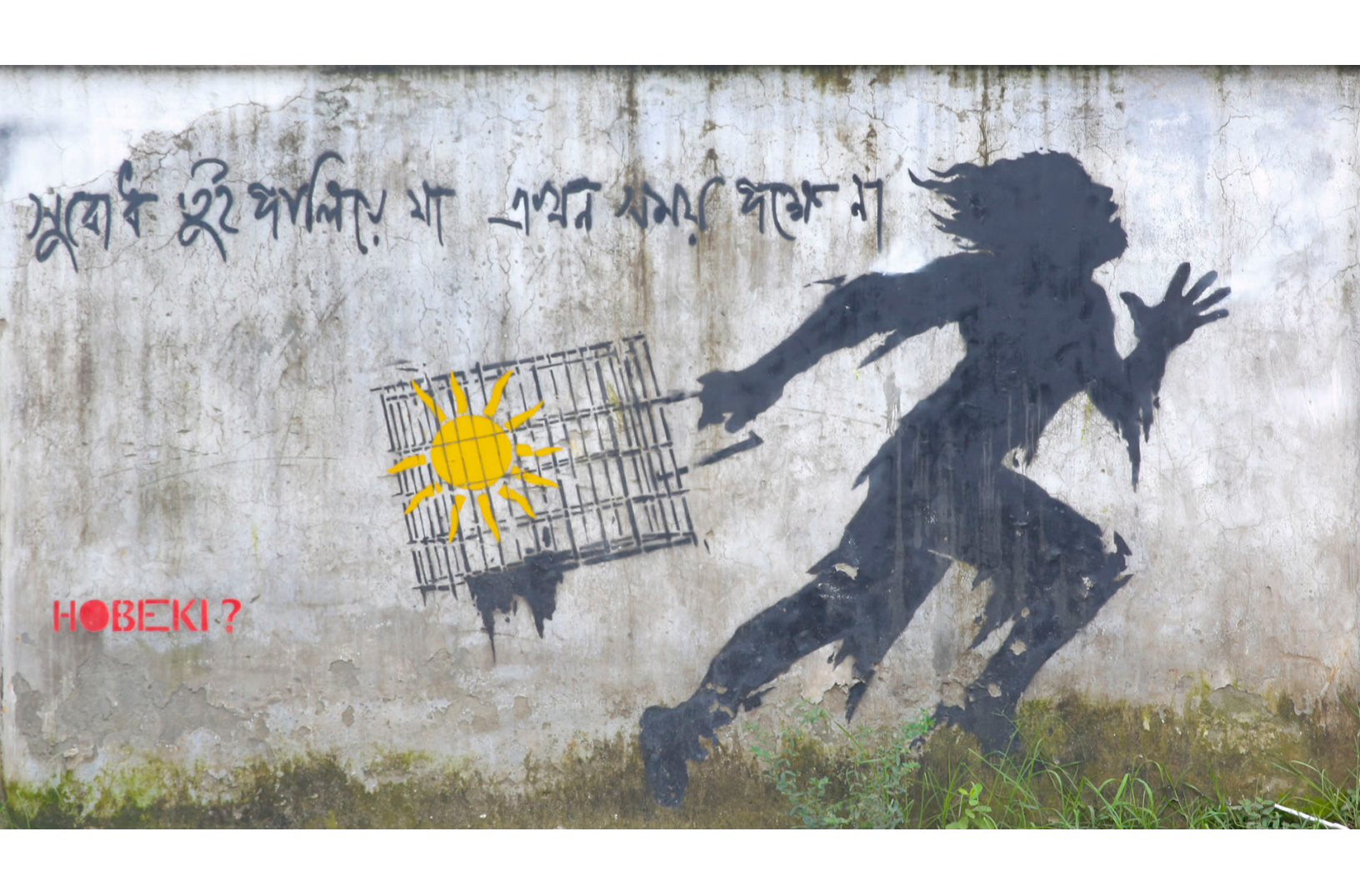
FIGURE 2 HOBEKI? "Run away Subodh, time is not on your side," 2017. Old Airport, Agargaon Mohakhali link road, Dhaka, Bangladesh.