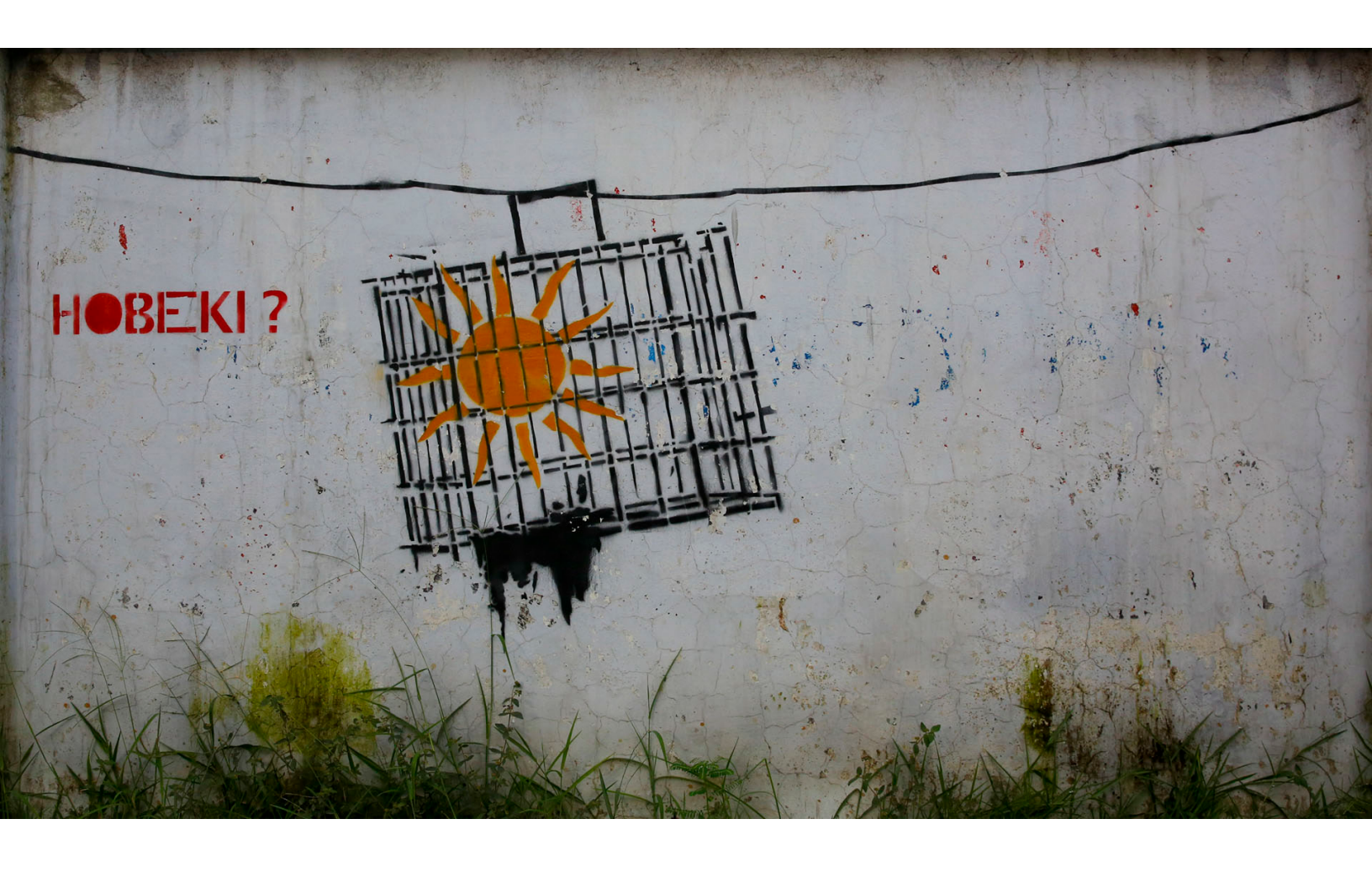
FIGURE 5 HOBEKI? "Bird Cage and Sun," 2017. Old Airport, Agargaon Mohakhali link road, Dhaka, Bangladesh.