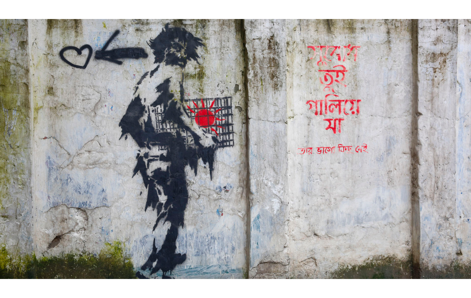
FIGURE 4 HOBEKI? "Run away Subodh, there is nothing for you here," 2017. Old Airport, Agargaon Mohakhali link road, Dhaka, Bangladesh.