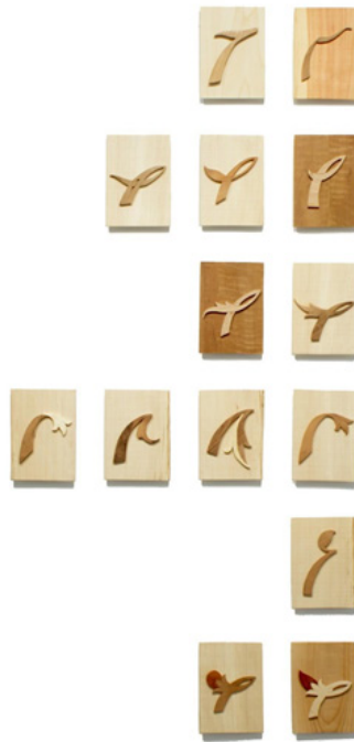
FIGURE 2 Soheila Esfahani, Made in Iran: The Break in the Tip of the Lotus Leaf, detail, various types of wood, 4.5” x 6.5” each plaque, 2010.