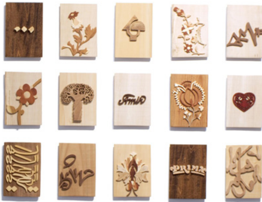
FIGURE 3 Soheila Esfahani, Made in Iran, detail, various types of wood, 4.5” x 6.5” each plaque, 2010.