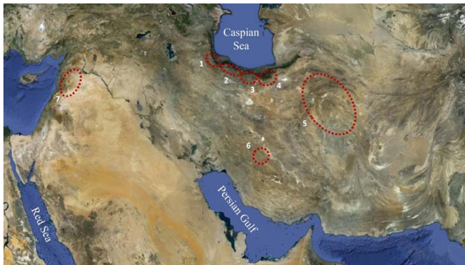
Figure 2: The approximate location of the main Isma'ili regions in Iran and Syria (11th -13th Century) 1- Rudbar, 2- Alamut, 3- Quimis, 5- Quhistan, 6- Arrajan, 7- Jabal al-Bahra Google Earth, Google, Cnes/Spot2012 Data SIO, NOAA, U.S.Navy, NGA, GEBCO. Image U.S Geological Survey.

were applied in the expansion of the Isma'ili dominions as offensive structures.