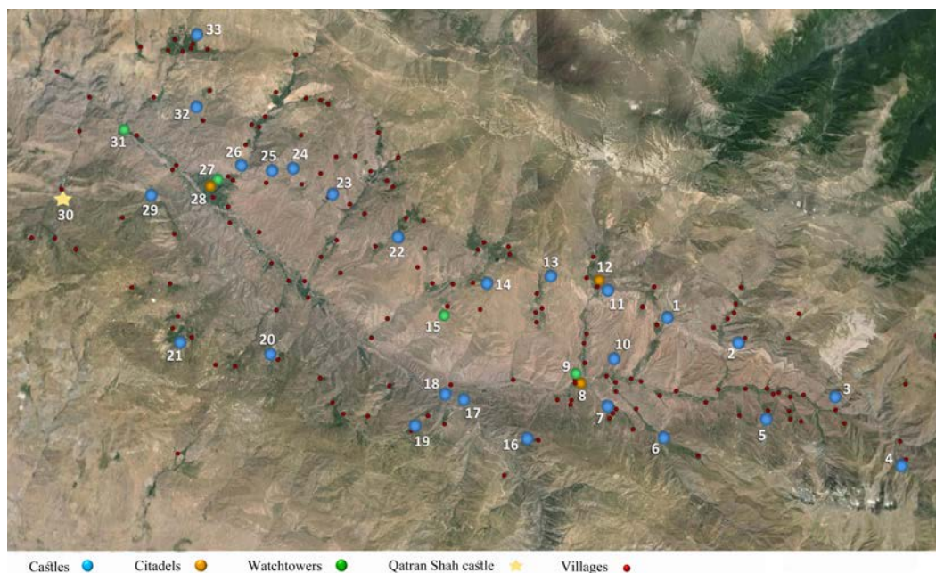
Fig 6: Schematic map of the distribution of villages and fortifications in the Alamut region

number of the castles as well as their size and defensive qualities increases. Therefore, although the primary function of the castles was defense against possible attack, in many cases they were established by the Isma‘ilis to expand and stabilize their authority. In fact, during the Alamut period, the capture and establishment of a castle was considered to be a way of imposing the authority of the Isma‘ilis on their surrounding areas.