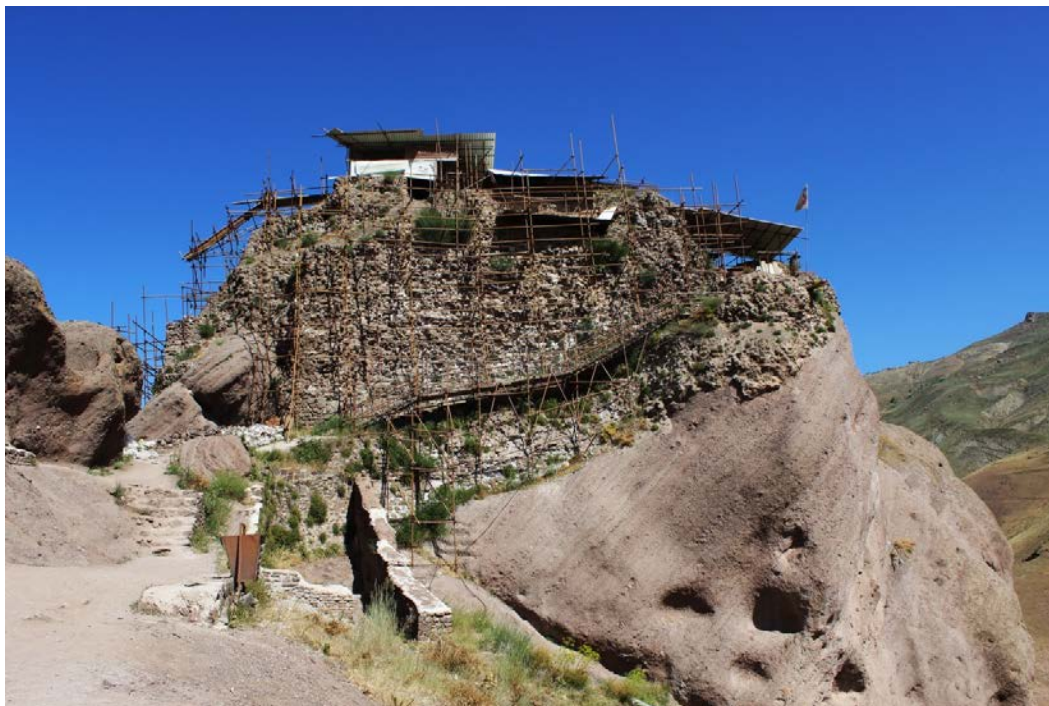
Figure 1: A view from the east to the upper part of Alamut Castle.

been considerably overlooked. Focusing on this lesser known aspect of the Isma'ili fortifications, this study makes an initial probe into the