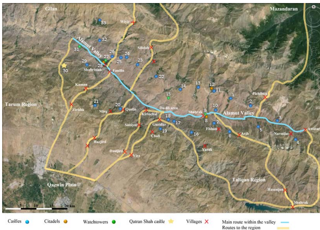
Fig 5: Schematic map of possible historical routes to the Alamut region and the distribution of the castles Google Earth, Google, Landsat2014

Isma'ilis to stop building the castles, implies the offensive function of