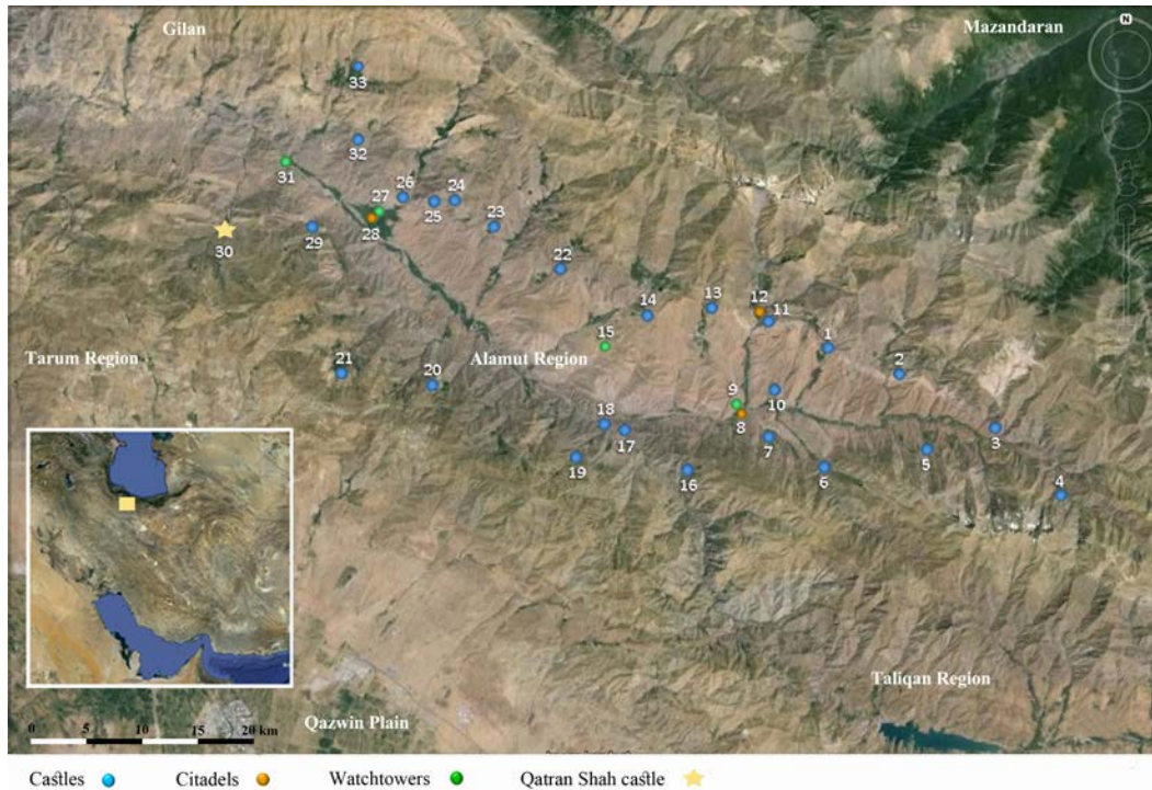
Figure 4: Schematic map of the distribution of fortifications in the Alamut region Google Earth, Google, Landsat2014

evidence of significant construction phases long before the Isma‘ilis took control of them. In these cases the Isma‘ilis modified and strengthened the castles, based on their requirements.