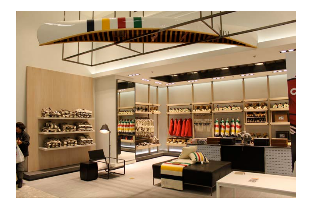
Figure 1: Inside the downtown Vancouver HBC store, in the basement floor. Andrew Macaulay. October 1, 2009, Vancouver, BC. Image courtesy of Andrew Macaulay.

around the waist and shoulders used a geometric diamond pattern in black and white. The same design was repeated at the corresponding level on the