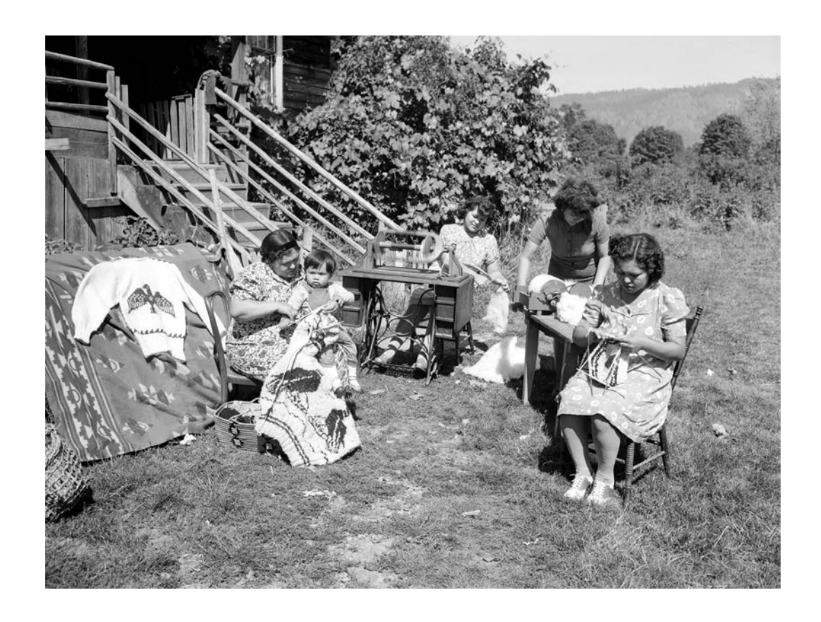
Figure 5: Ministry of the British Columbia Secretary and Travel Industry, Film and Photographic Branch. Indian Sweater Making by The Charlie Family . 1946. Image I-27571, courtesy of the Royal BC Museum and Archives.