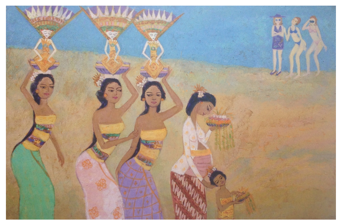
FIGURE 3 Cokorda Isteri Mas Astiti, Women of Two Continents, 1993, oil on canvas, 70 \times 100 cm, Seniwati Gallery.

Source: Vickers, Adrian. Balinese Art: Paintings and Drawings. Singapore: Tuttle Publishing, 2012.