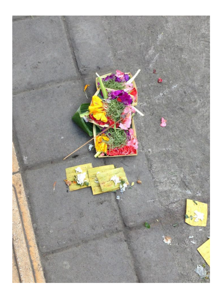
FIGURE 2 Photo of canang and jotan offerings, Ubud, Bali, 2014.

I propose that, in addition to having a ritual function and symbolism, offerings are works of art with pronounced aesthetic and technical qualities as well as strong personal meanings. In addition, some individuals in Bali are considered experts in making offerings and understand the complexities of their meaning and use; many of them are sought out by Balinese living in other areas of the island. This artistic training further demonstrates the need to address offerings as an equally valid object and art practice. Because of their impressive visual and technical qualities, offerings challenge an earlier Western notion of 'art' focused on objects like painting, sculpture, and architecture. Although some more modern and contemporary Western or Euro-American artistic projects do include the idea of impermanence, references to the ephemeral can be seen particularly in performance art and works done with materials that decompose easily.