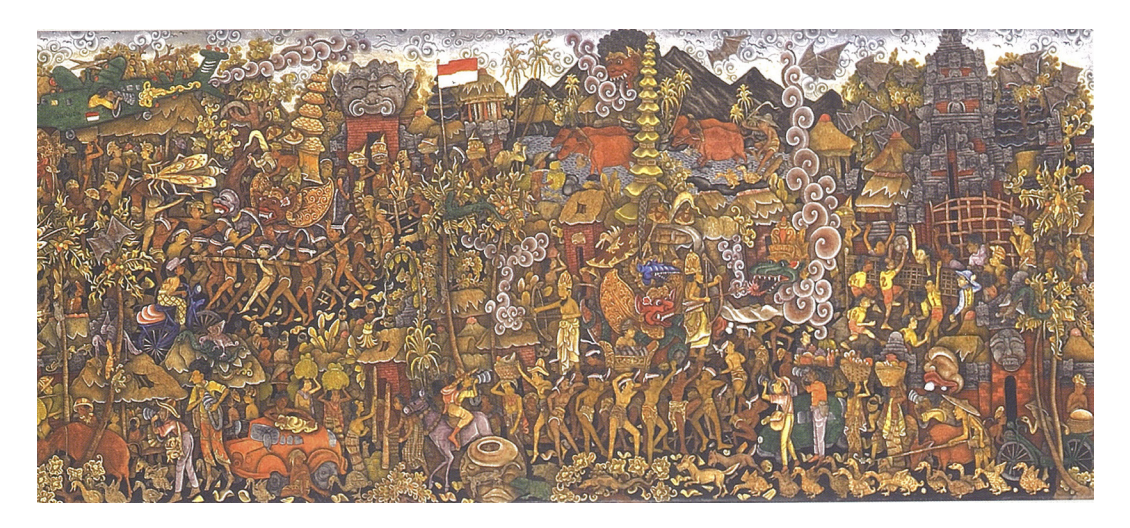
FIGURE 5 I Wayan Bendi, Modernity , 1995, ink and acrylic on canvas, 61 x 302 cm, (Right side of canvas)

Indonesian flags, as seen in this painting, and by doing so he challenges the nation and places it in dialogue with Balinese society.