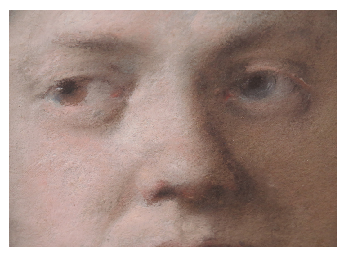
FIGURE 2 Rosalba Carriera, Self-portrait (detail), pastel on paper, 31 x 25 cm. Venice, Gallerie dell'Accademia.

Further highlighting this association between herself and literary and philosophical greats, Carriera's dual-coloured eyes do refer to her blindness, as one had turned from blue to brown after her cataract surgery. But rather than being a literal reference, the eye colour and the previously mentioned fleshy lower lids that emphasize them, highlight her eyes and act in an iconographical manner (fig. 2). Representations of a blind old man anointed with laurel leaves were interpreted