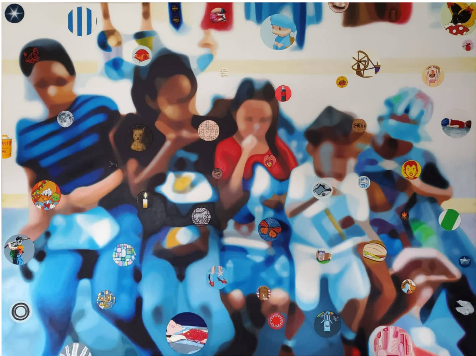
"Ninth November night 01" Oil on canvas, 2019