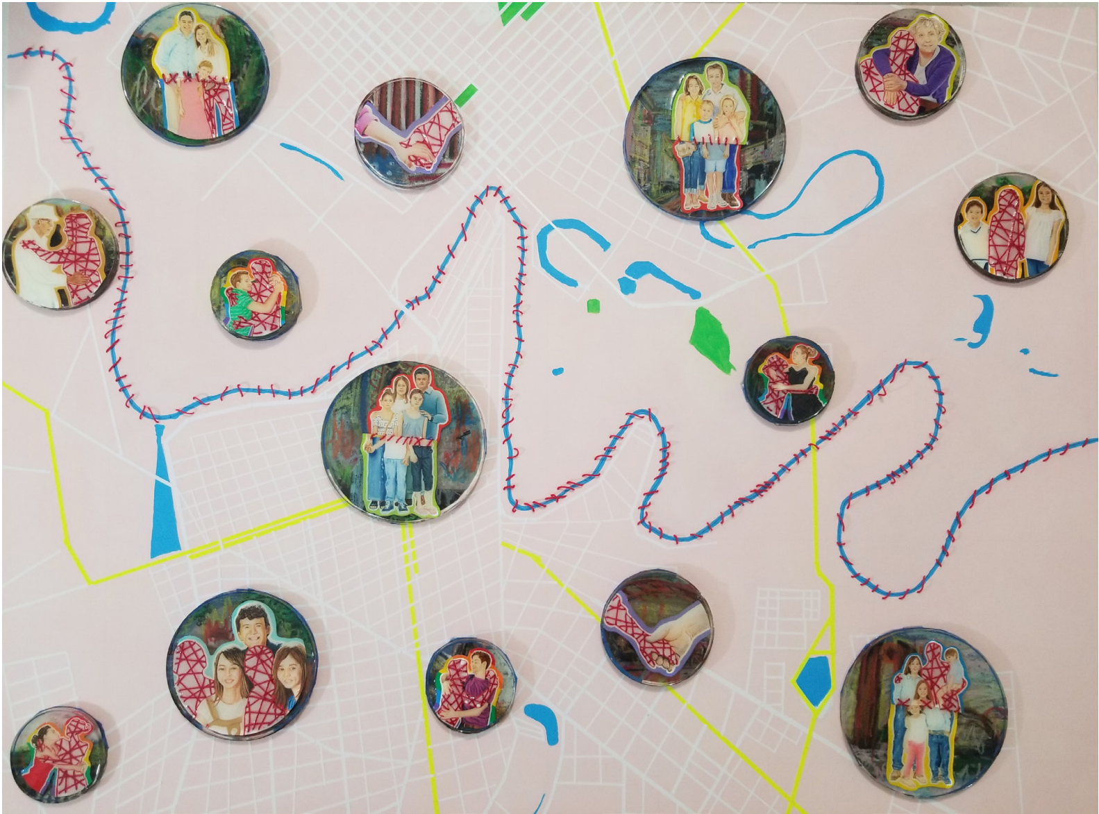
"Twin cities torn apart" Oil on canvas, 2020