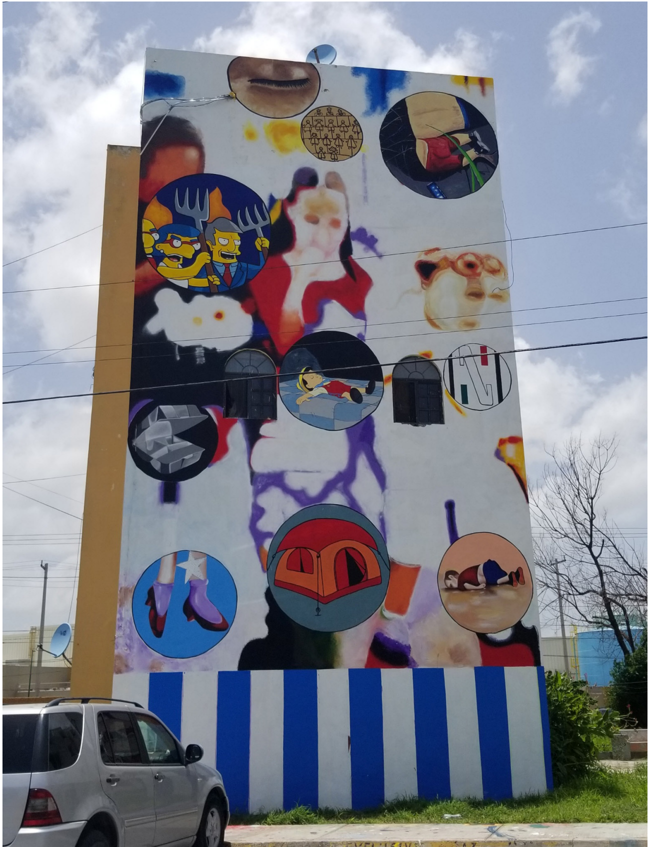
“Ninth November night 02” Urban Mural (Matamoros, Mx), 2021