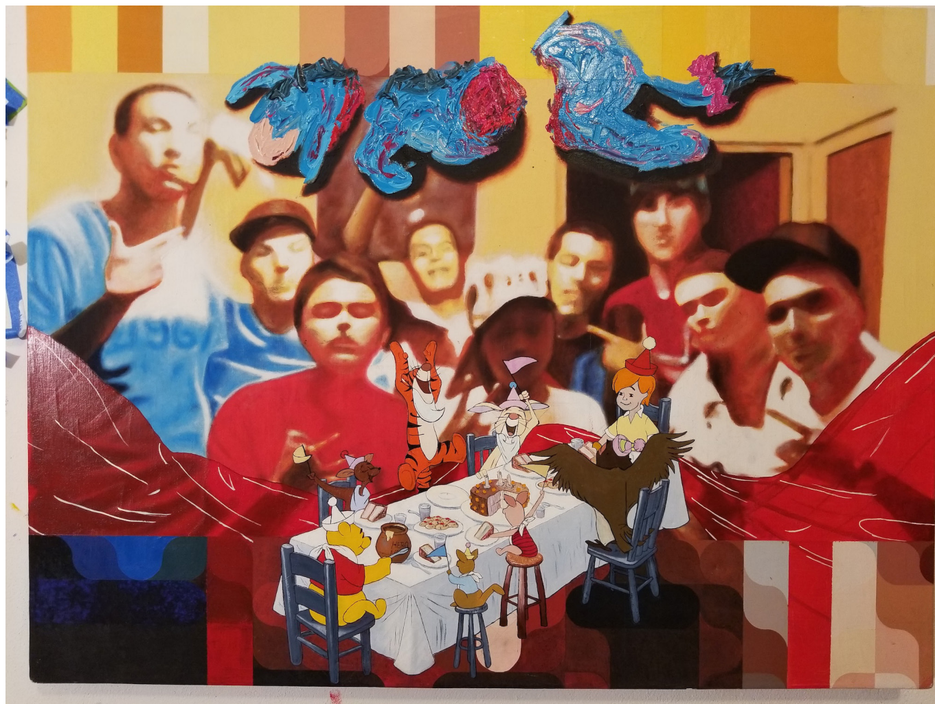
"The last supper" Oil on canvas, 2018