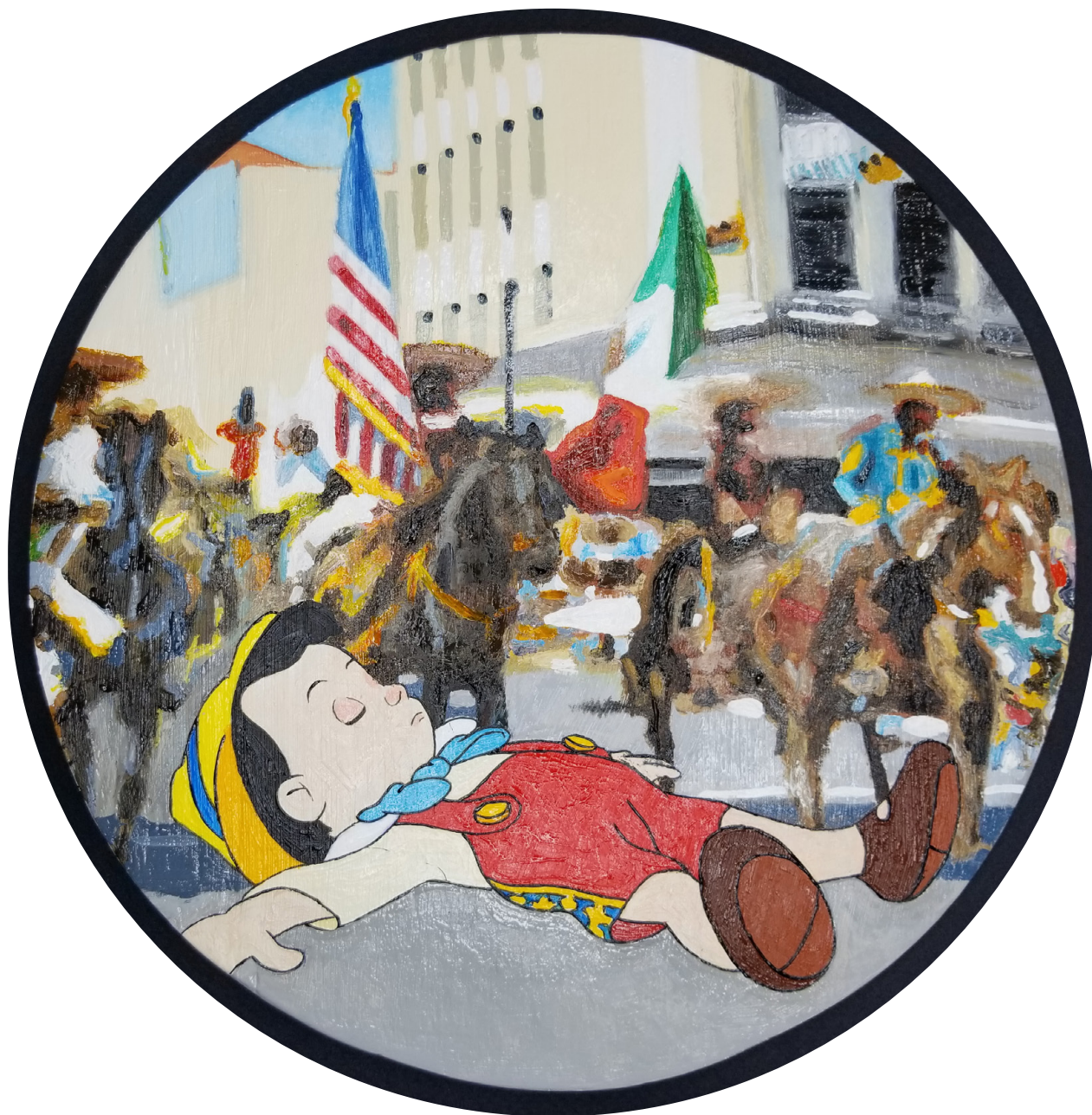
"Sonso ladeado" Oil on Wood, 2022