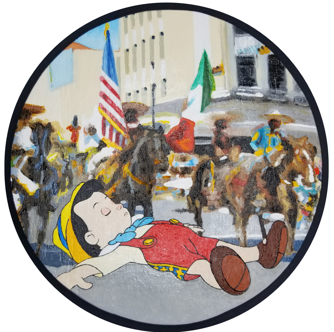
“Sonso ladeado” Oil on Wood, 2022