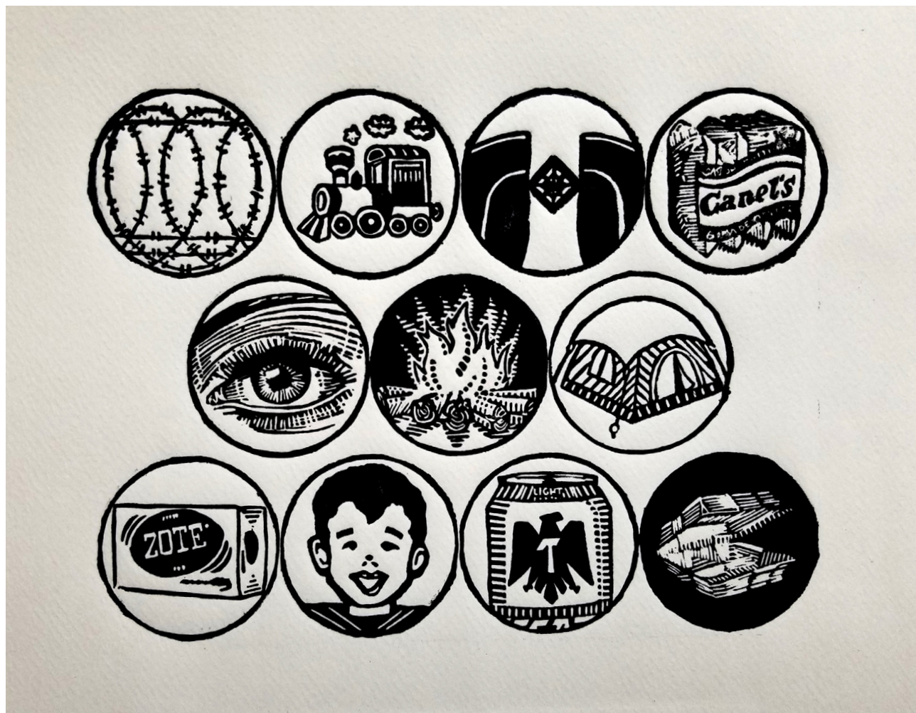
"Migrants 01" Linoprint, 2020