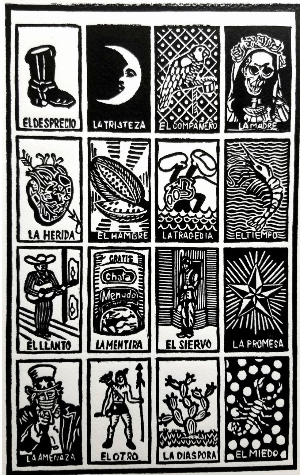
"Migrants 04" Linoprint, 2020