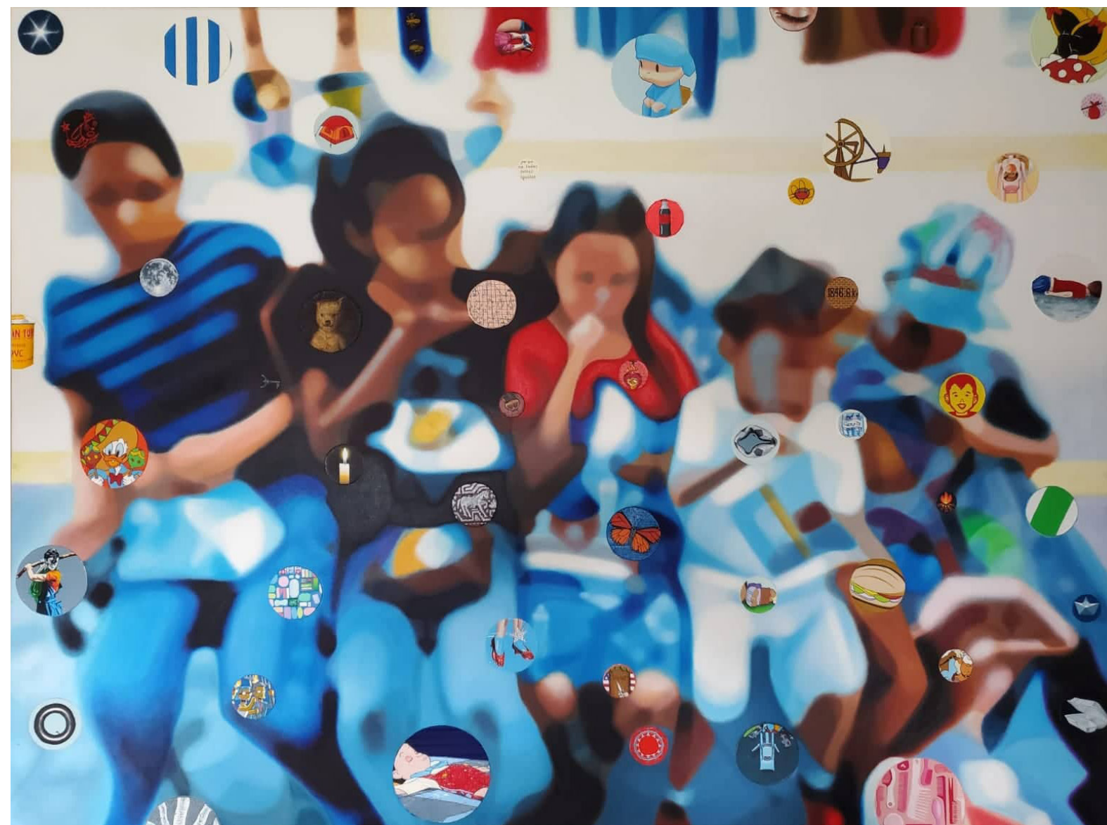
"Ninth November night 01" Oil on canvas, 2019