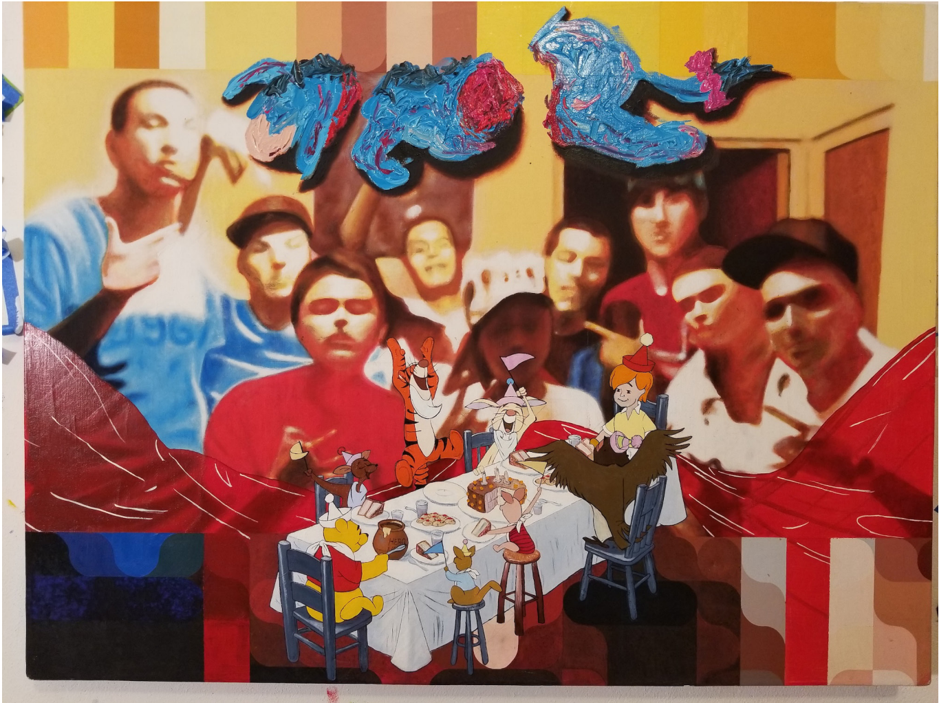
“The last supper” Oil on canvas, 2018