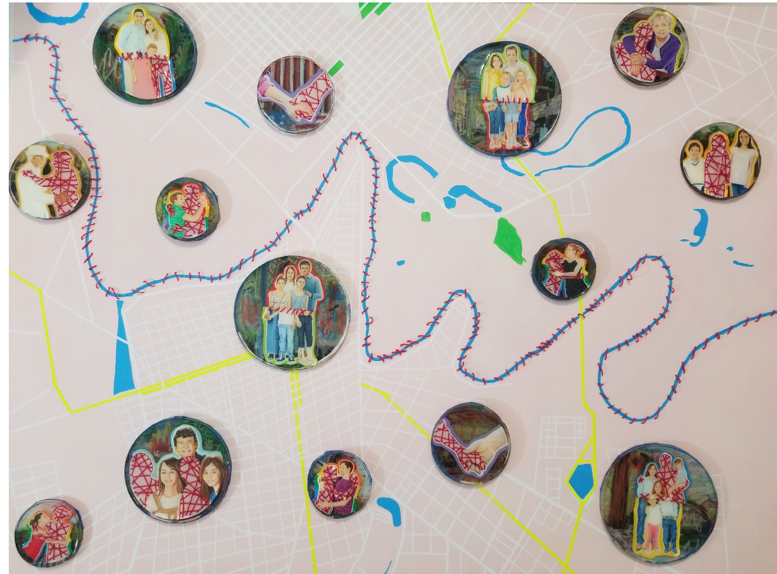
"Twin cities torn apart" Oil on canvas, 2020

Email: mariojimenezdiaz_artista@outlook.es