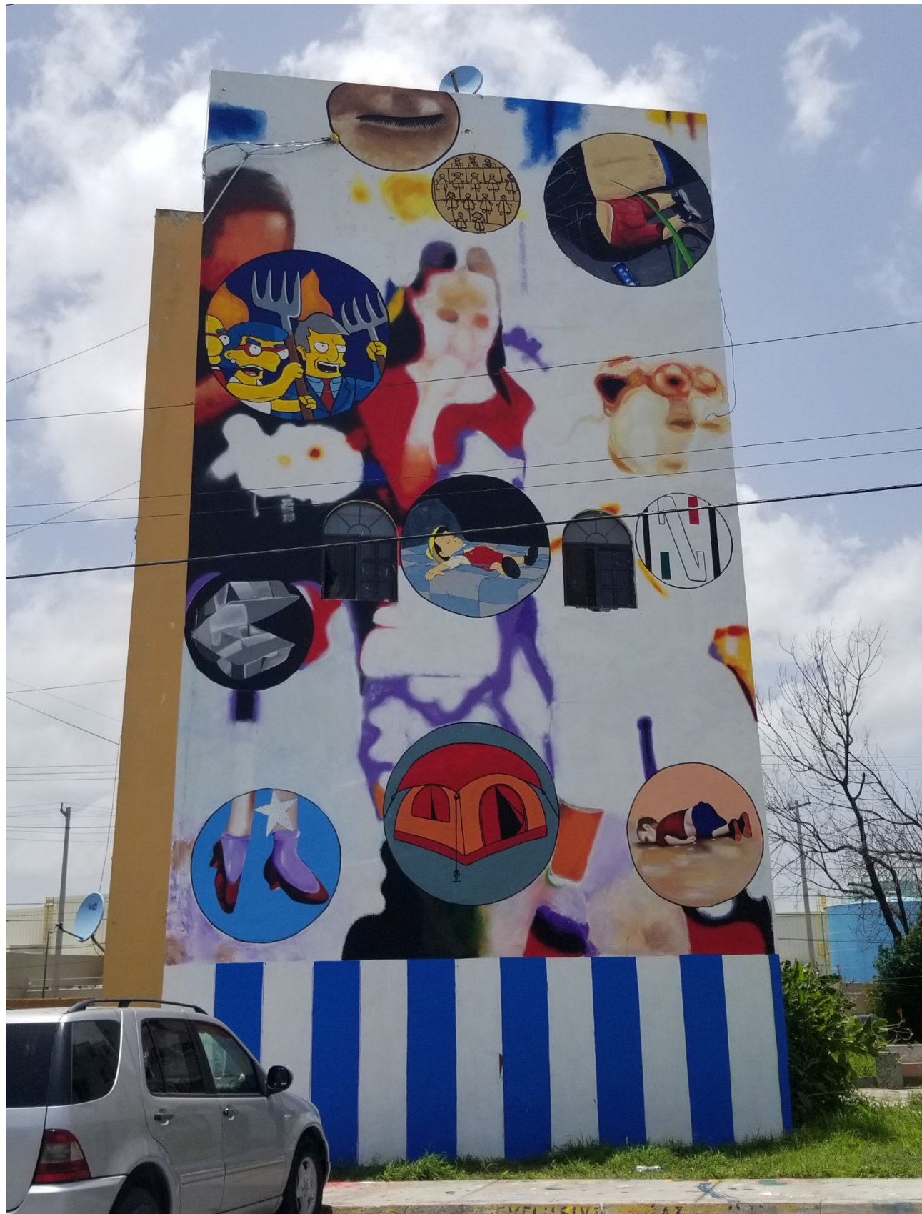
“Ninth November night 02” Urban Mural (Matamoros, Mx), 2021