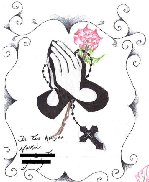
"In God's Hands"