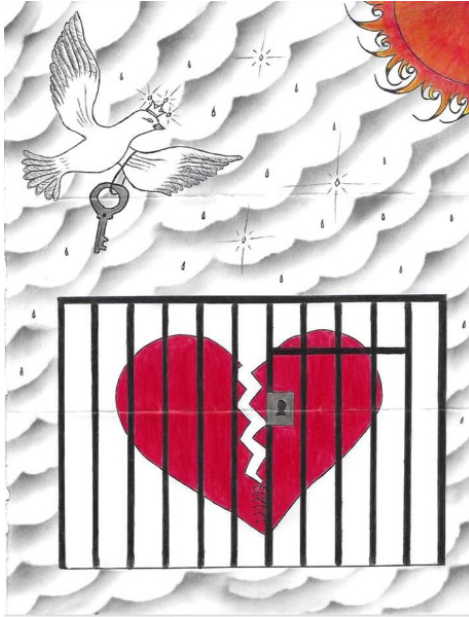
"Incarcerated Hearts: Life in an Immigration Detention Center"