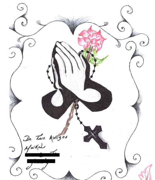
"In God's Hands"