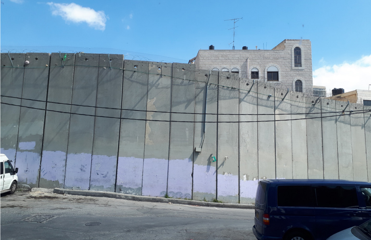
Figure 1. Two views of the separation wall. Photographed in east Jerusalem by the author, 2018.