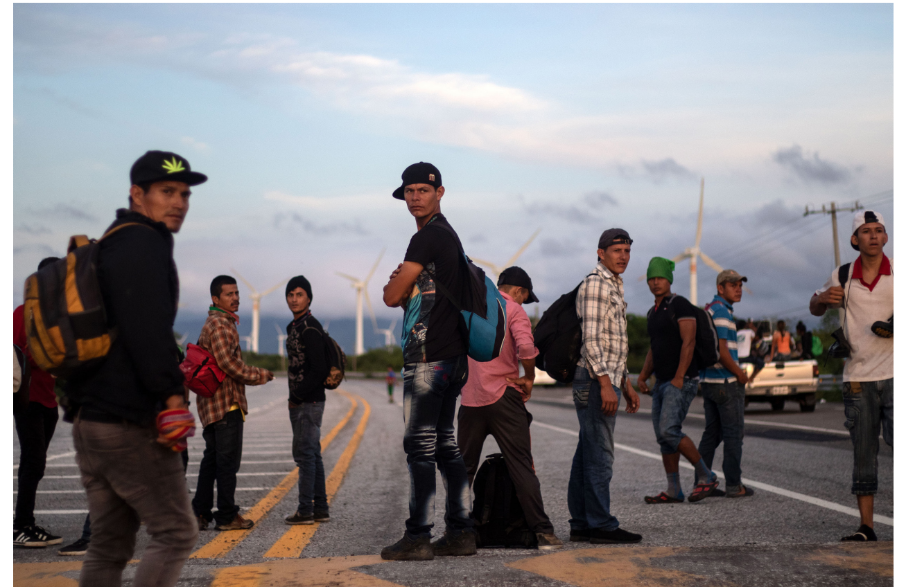
Above: A group of Honduran migrants taking part in a caravan heading to the US, wait for a ride after leaving Santiago Niltepec heading to Juchitan, near La Blanca town in Oaxaca state, Mexico on October 30, 2018.