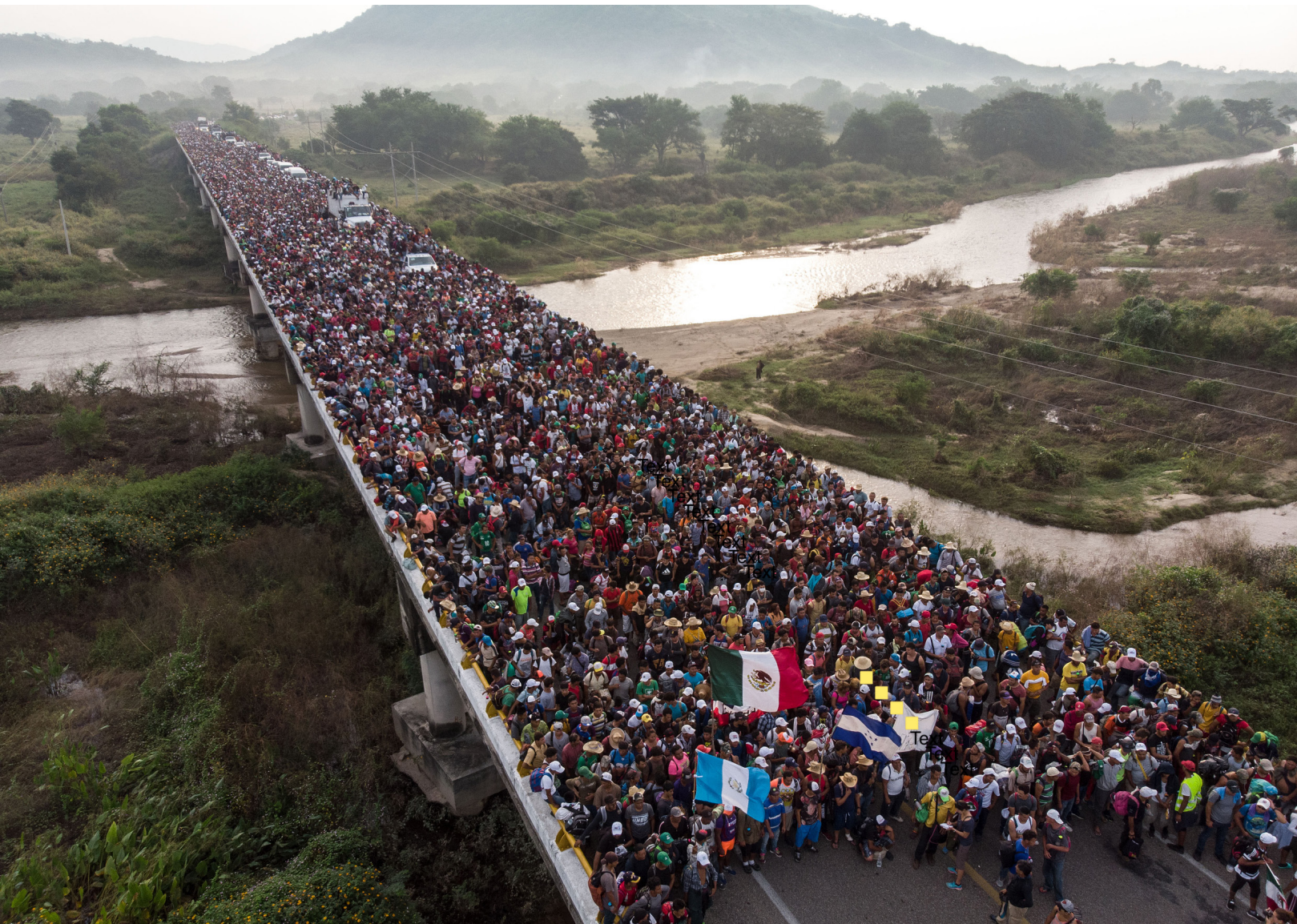
Above: Aerial view of Honduran migrants taking part in a caravan heading to the US, as they leave Arriaga heading to San Pedro Tapanatepec, southern Mexico on October 27, 2018.