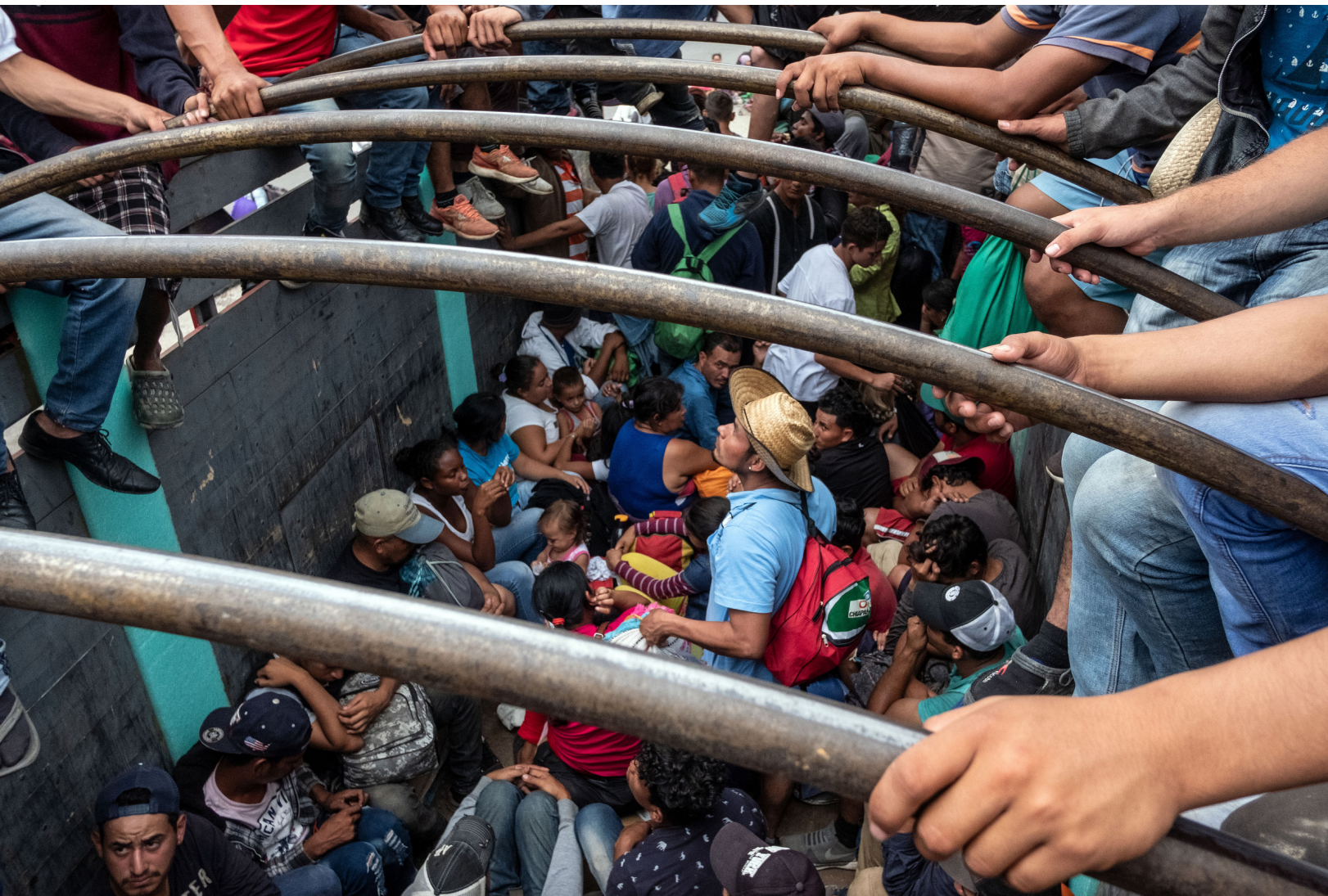
Above: Migrants — mostly Hondurans — heading in a caravan to the US, are seen onboard a truck as they catch a ride in Isla, Veracruz state, on their way to Puebla, Mexico, on November 3, 2018. President Donald Trump previously warned that soldiers deployed to the Mexican border could shoot Central American migrants who throw stones at them while attempting to cross illegally.