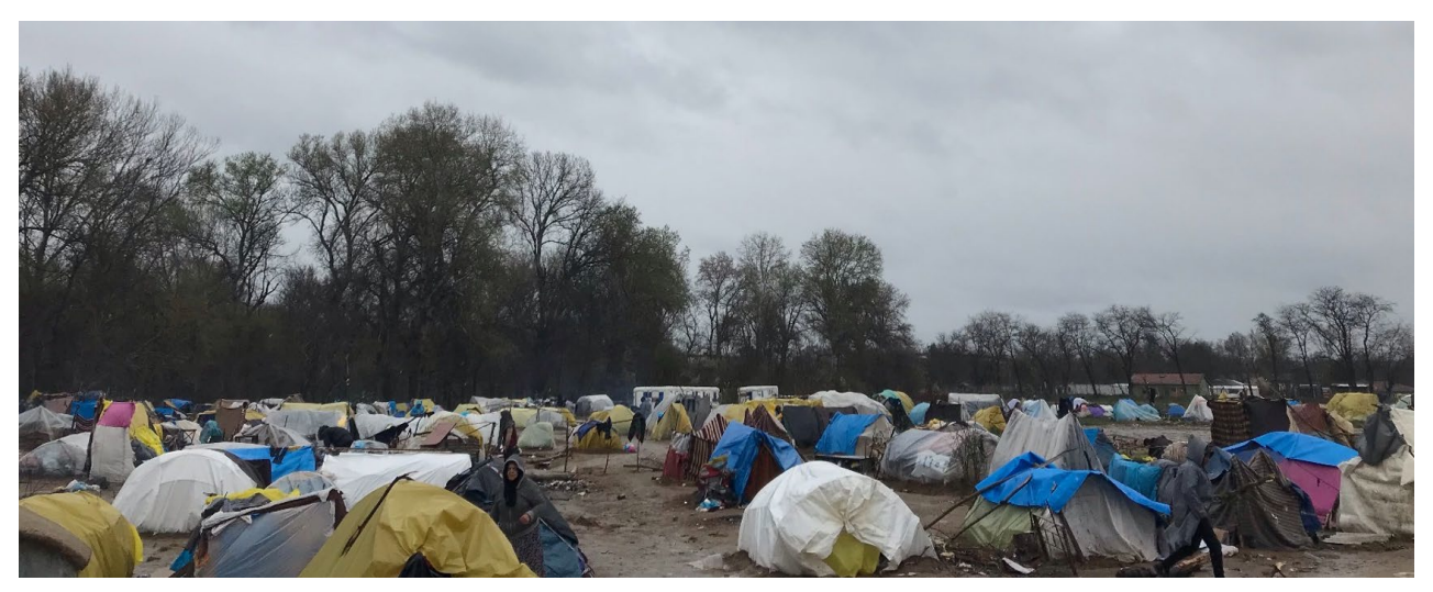
Figure 1. Makeshift camp near Turkey's Pazarkule border crossing.

As a precautionary measure, Greek authorities increased the number of police on the border (Aljazeera 2020) and began extending the border fence. Currently, the Turkish-Greek land border is overshadowed by tensions in the Eastern Mediterranean triggered by both countries' gas drilling ambitions. Both countries' overlapping claims in the Eastern Mediterranean not only brought them closer to war, but strained further Turkey-EU relations. As Turkey is a key transit country for asylum seekers and migrants, Turkish-EU cooperation will continue to be essential in mitigating future refugee and migrant crises. Notwithstanding that both parties have failures in the process, Turkey should focus its attention on solving existing crises, rather than creating new ones.