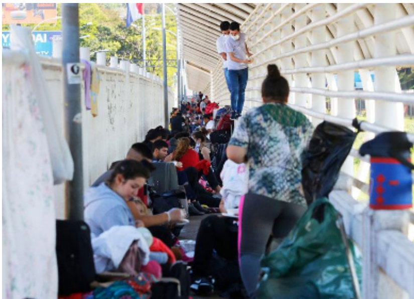
Figure 3. Paraguayans trapped on Amizade Bridge. Photo: H2Foz, May 20, 2020.