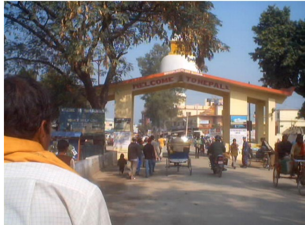
Figure 2.

Now, a new mechanism should be introduced at border crossing-points. In the immigration corridor, digital cameras with a stand should be fitted over desks. Travelers must put their identity cards or citizenship certificates on the desk under the camera. Then they should proceed out of the corridor to cross the international border. At the same time, they should be monitored by CCTV cameras from inside the corridor and digital images should be saved in the monitoring wing. If he/she is suspected as a recorded criminal or red corner noticed terrorist, they must be interrogated. Images of notorious criminals should be displayed on the wall of the immigration corridor. This system/mechanism could check and arrest international criminals and terrorists on the border-point and prevent them from misusing the international border. But it should be managed in a regulated way for the movement of borderland community people to strengthen the people-to-people relations between Nepal and India.