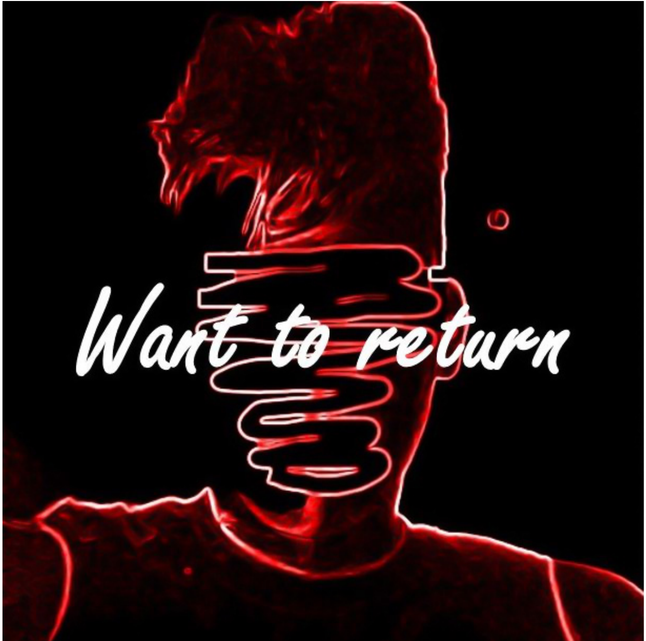
5. Want to Return: After spending time away, I yearn to go back to my roots. The call to return home.