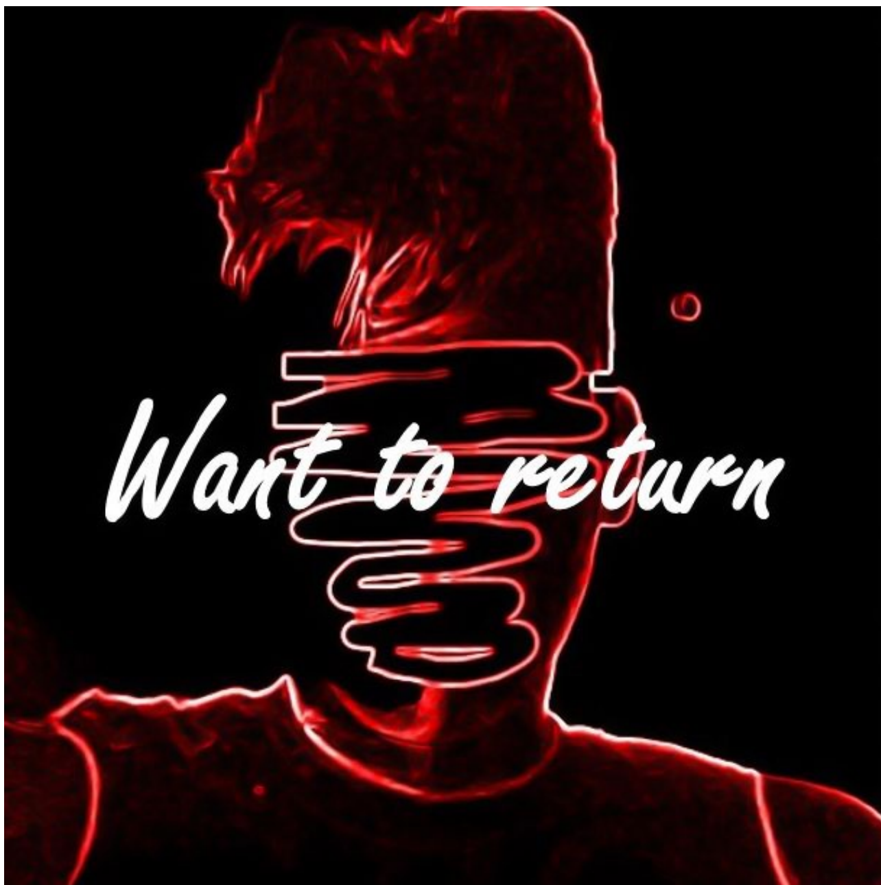
5. Want to Return: After spending time away, I yearn to go back to my roots. The call to return home.