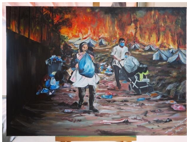
Figure 3. Untitled, painting by Najib Hosseini, 2021. Reproduced with the permission of the artist.

Many refugees also engage with artistic projects in their everyday lives, such as attending art workshops at the Hope Project, while waiting for the processing of their asylum claims on Lesvos. Creative practices allow refugees to reflect on their past and "reinvent themselves" to give direction to their future endeavors (see Oelgemöller 2011, 409; Turner 2015). The workshops have been a retreat location for many refugee artists, such as for Abdullah: