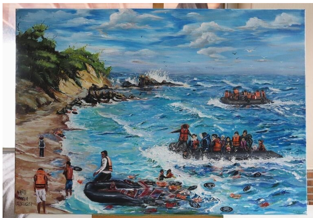
Figure 1. Untitled, painting by Najib Hosseini, 2021. Reproduced with the permission of the artist.

Revealing how the artists perceive and experience border(ing)s, some paintings concerning past journeys also recount how refugees overcome these constructs, such as through border crossing. As these paintings depict, a significant number of refugee journeys are 'successful', articulating that refugees managed to cross various borders and arrive at the EU shores following an arduous voyage (Figure 1). The painting by Najibullah (Najib) Hosseini, an Afghan artist who resided in Moria for nearly two years, realistically illustrates the rubber boats arriving at the shores of Lesvos (Figure 1). 11 In this painting, Najib clearly demonstrates the landing