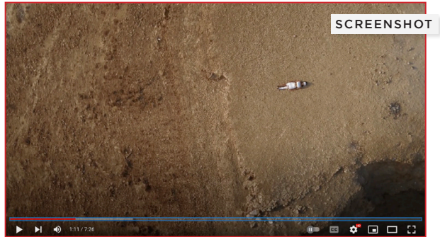
The Muse (2021) (7 min., 27 sec.): https://youtu.be/Na_8H0lhZlk