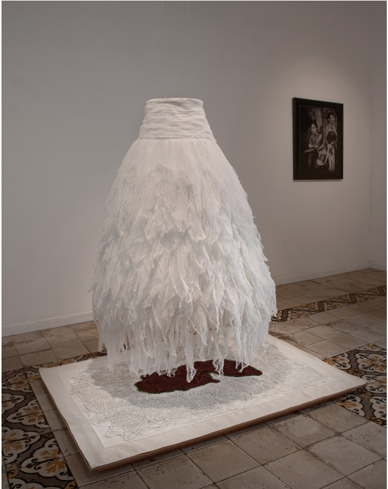
Virgin of Israel (2023)

Installation: Red Embryo and Gauze Dress (dress in collaboration with Design Studio Lemberg).