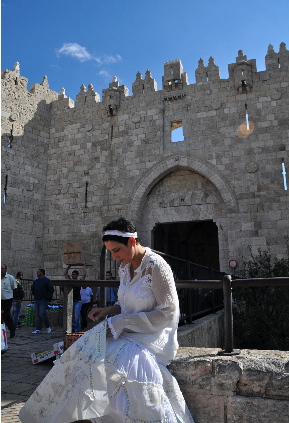
The Green Thread (2011) Performance at the Damascus Gate in Jerusalem Old City.