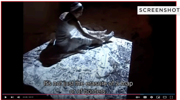
Border Land - Alternative Ways of Mapping Jerusalem (2012) (29 min., 20 sec.):