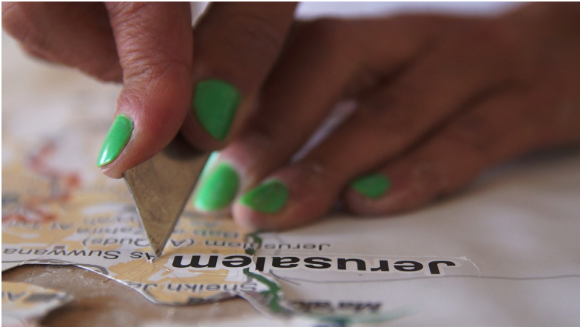
Operating on an OCHA closure map of Jerusalem (2004) Still from the film DADA-JERUSALEM (2014).