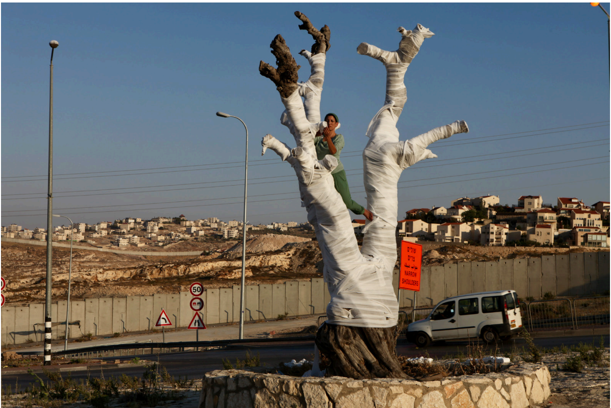
Top: The Muse (2020) Performance at Metsuke Dragot, Judean Desert.