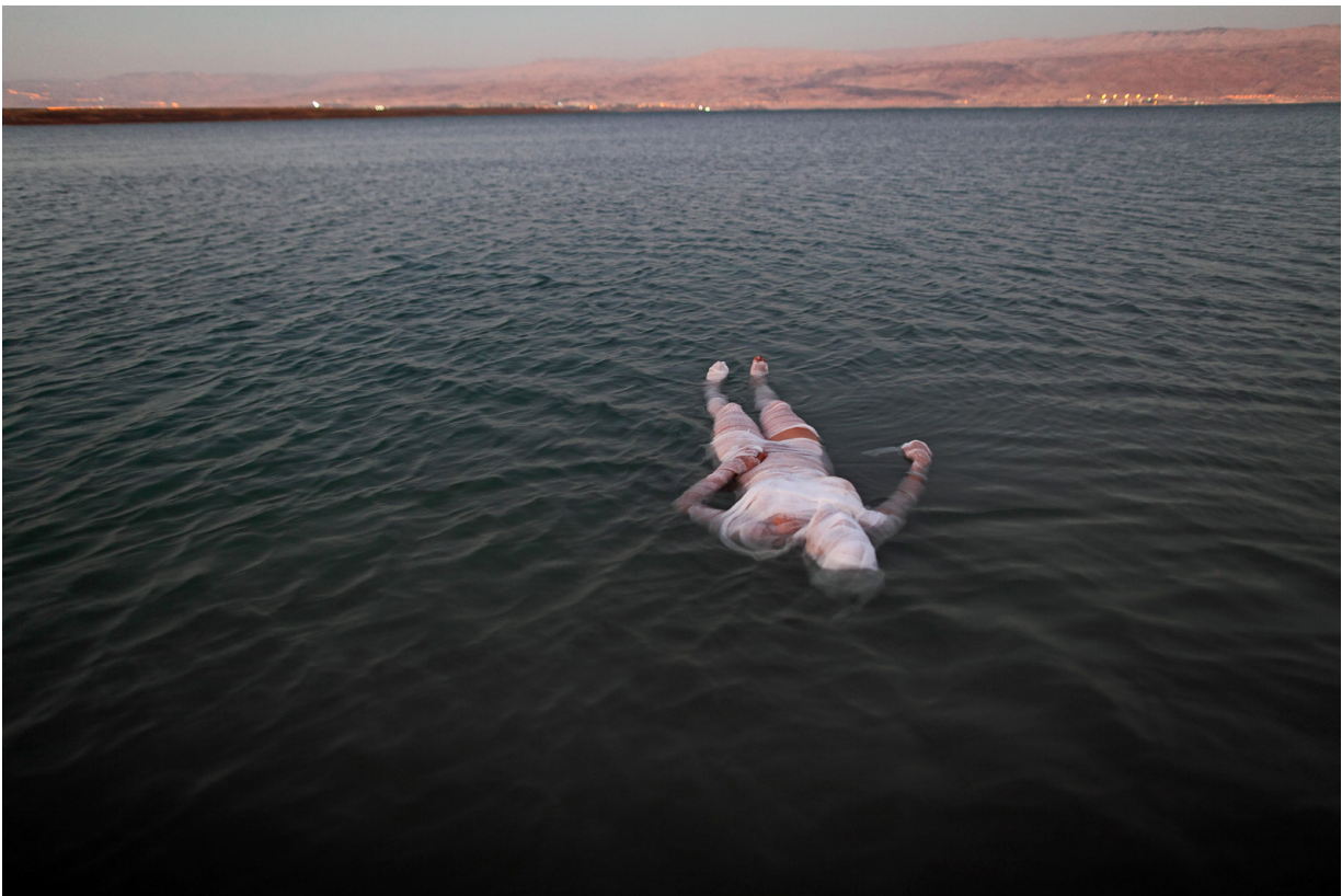
Top: After The Watchman (2018) Performance at Alexander Zaïd Monument, Jezreel Valley.