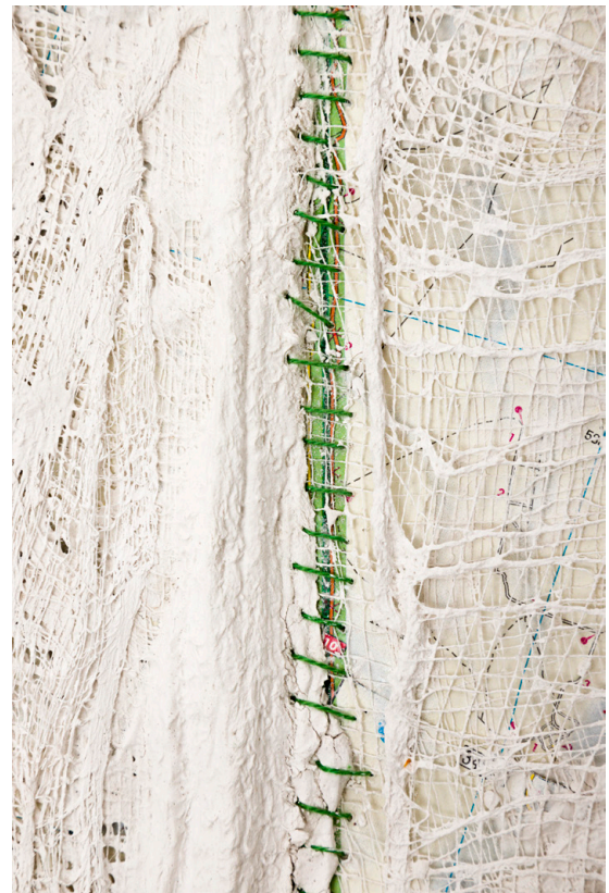
Wounded Map (2020-2021) (with details)

Map, gauze bandages, fabric, plaster, ink, thread, and fabric. 340 x 170 cm. Based on the Holy Land "Road Map of Israel-Palestine 1:150,000" printed by Freytag & Berndt (2016), the Corona "Traffic Light Map" of the National Emergency Portal (2020-21), "The Black Flag Protest Map" (2020-21), and the "National Emergency Portal" during the Israel-Hamas conflict (2021).