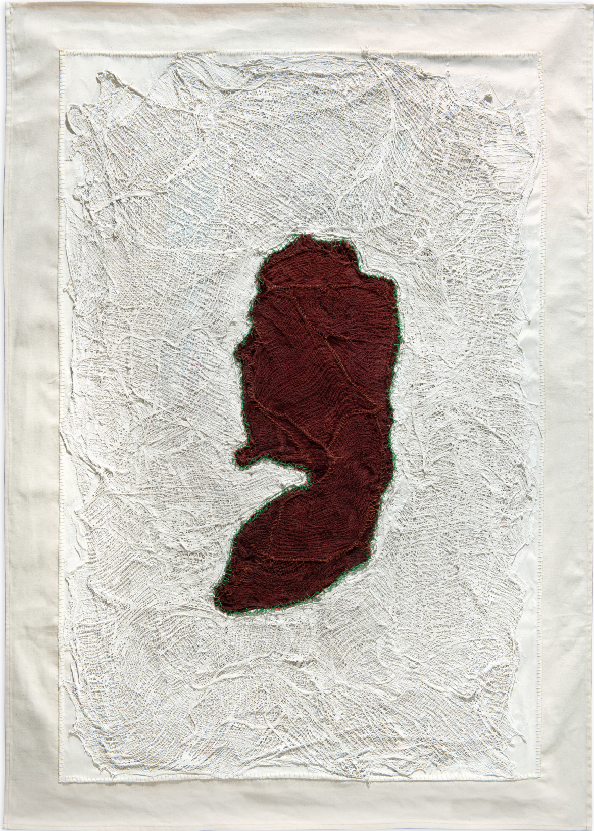
Red Embryo (2023)

Map, gauze bandages, fabric, plaster, red ink, and thread. 140 x 99 cm.