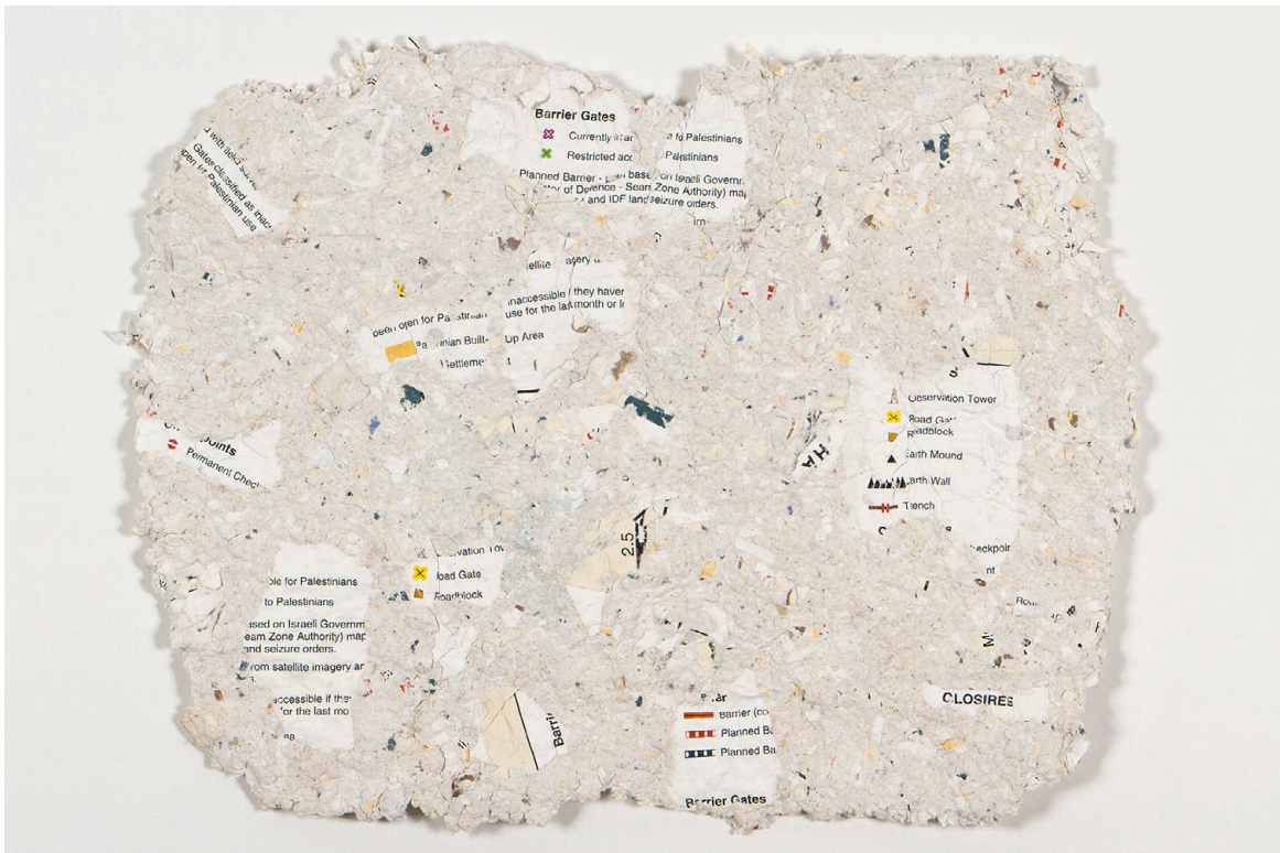
Shredded Land, Index (2010). Paper mache.