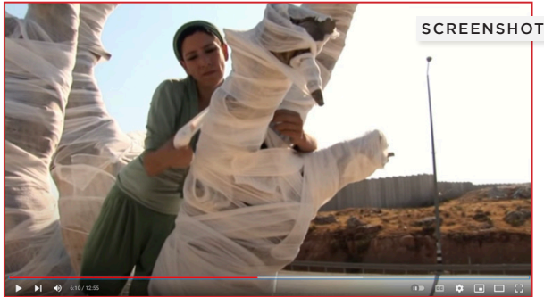
The Olive Tree (2012) (12 min., 56 sec.)