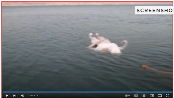
Sea of Death (2010) (9 min., 19 sec.)