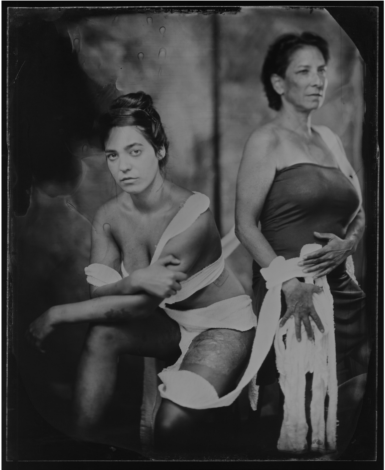
The Artist and Her Muse (2020) Wet Plate Collodion, 80 x 70 cm.