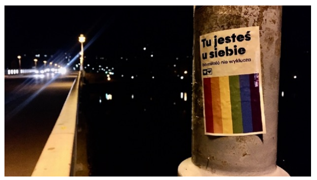
Figure 5. LGBTQI+ Activist Poster: "Tu jesteś u siebie" ("Here you are at home").

The welcoming message is highlighted by the socio-semiotic setting of the sticker at eye level [CAMERA] appearing in a spotlight of the street lamp [DOMINANCE] and Poland, which appears in the darkness of day on the other side of the illuminated bridge, seems to be far away [IMAGE, DISTANCE], which strengthens the impression of a safe space across the border [BRIDGING, ACTOR RELATION]. This designated counter-act of territorialization using stickers to welcome newcomers triggers the perception of certainty on a spatial inclusion mechanism.