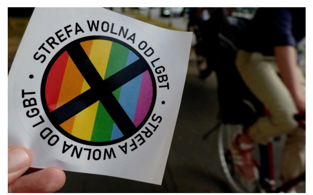
Figure 4. Territorializing with hate-stickers: "strefa wolna od LGBT" ("LGBT-free zones").