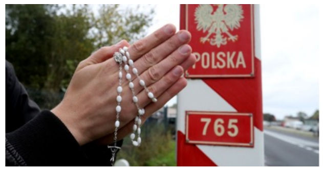
Figure 3. Religious territorialization . Source: Oworuszko (2017). Copyright Andrzej Szkocki.

As a matter of fact, the multimodal pattern of a rosary symbolizes the polydimension of the bordering practice which can be observed in this pattern of interpretation: on the one hand, we can outline the act of manifesting the territory of Poland by clearing borders with bordering practices, as followers of the