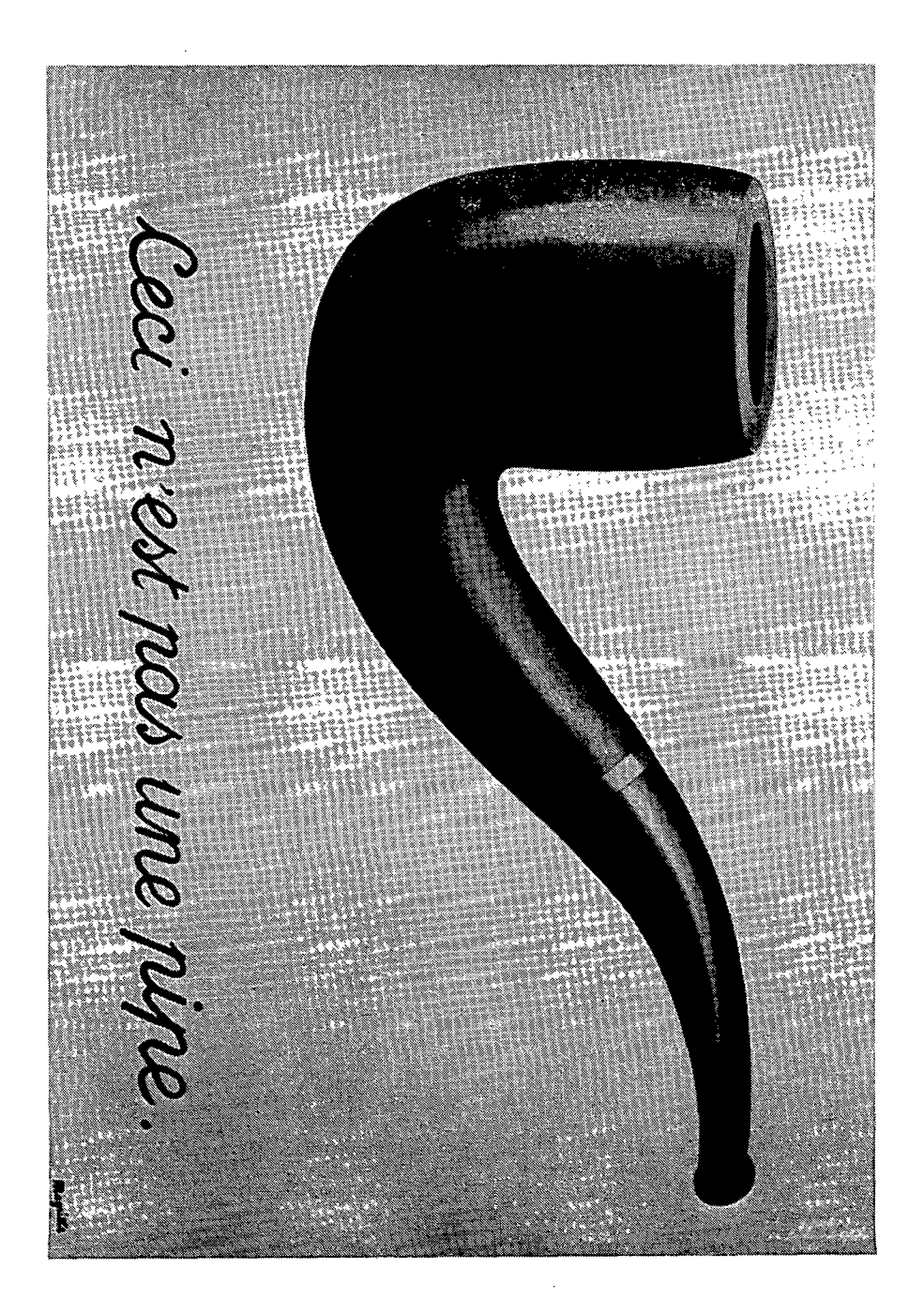
The Betrayal of Images/La trahison des images. 1929. Los Angeles County Museum of Art