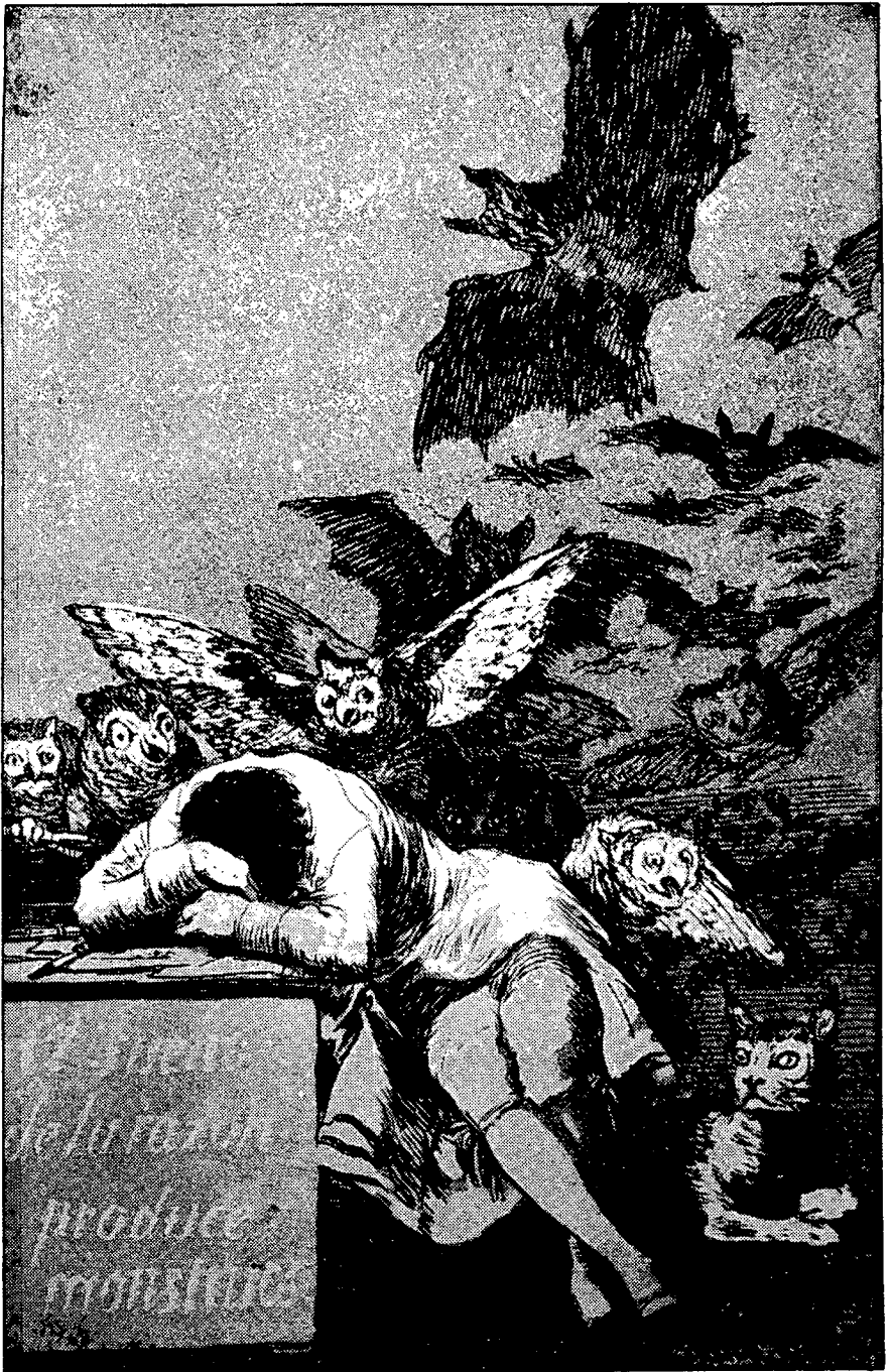
F. Goya Capricho no. 43