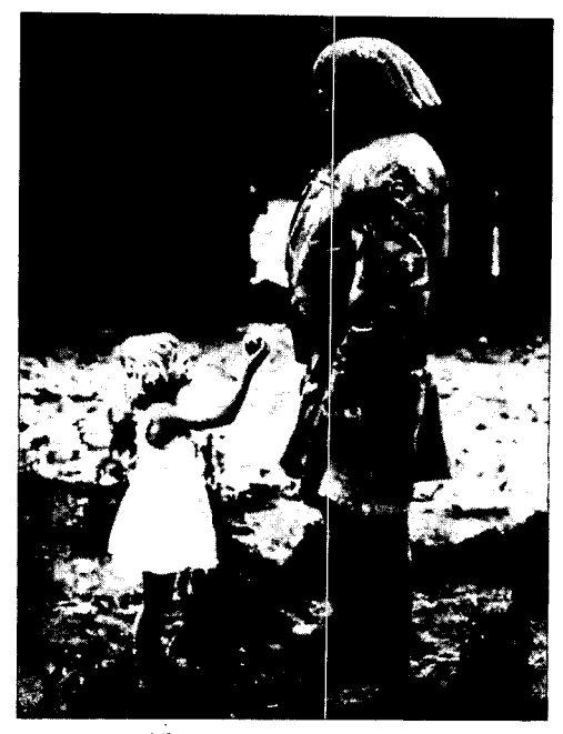
The Expressionist Other: The Golem