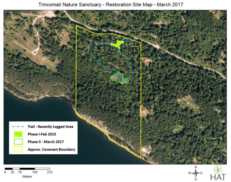
Figure 2. Two sites in the TNS that were replanted with native species after the invasive species were removed.

al., 2013). Then, in 2009 the Habitat Acquisition Trust (HAT) signed a formal management agreement ensuring that long term management of the Sanctuary would continue and took over as the current management group. In 2013 the management plan and site inventory was updated by HAT. Since taking over management, HAT has been conducting extensive invasive species removals of Scotch Broom ( Cytisus scoparius ), English Holly ( Ilex aquifolium ), and Himalayan Blackberry ( Rubus armeniacus ) every year (Habitat Acquisition Trust et al., 2013). Additionally, HAT has implemented two plantings of native species (one in 2015 and one in 2017) in two of the largest areas to previously have broom (Figure 2).