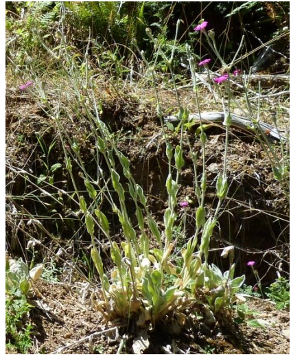
Figure 14. Rose Campion flowering.

Rose campion is an invasive species from Europe and Asia introduced as a garden cultivar with silvery grey stems and deep pink or white blossoms which can grow up to 2-3 feet tall (Figure 14). This species cannot survive harsh winters which make the temperate coast of BC an ideal place for this specie to grow.