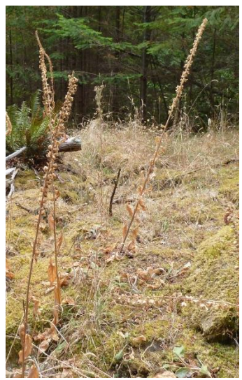
Figure 15. Foxglove plants dying off with seed pods ready to be released.

Foxglove is a toxic biennial plant that is fatal to animals who consume even small amounts (IPCW Plant Report, 2017). It survives best in disturbed habitats, colonizing disturbed soils and forming dense patches causing native vegetation to be displaced (IPCW Plant Report, 2017). It can only reproduce by seed and in areas with disturbed soils the seeds establish more readily (Figure 15).