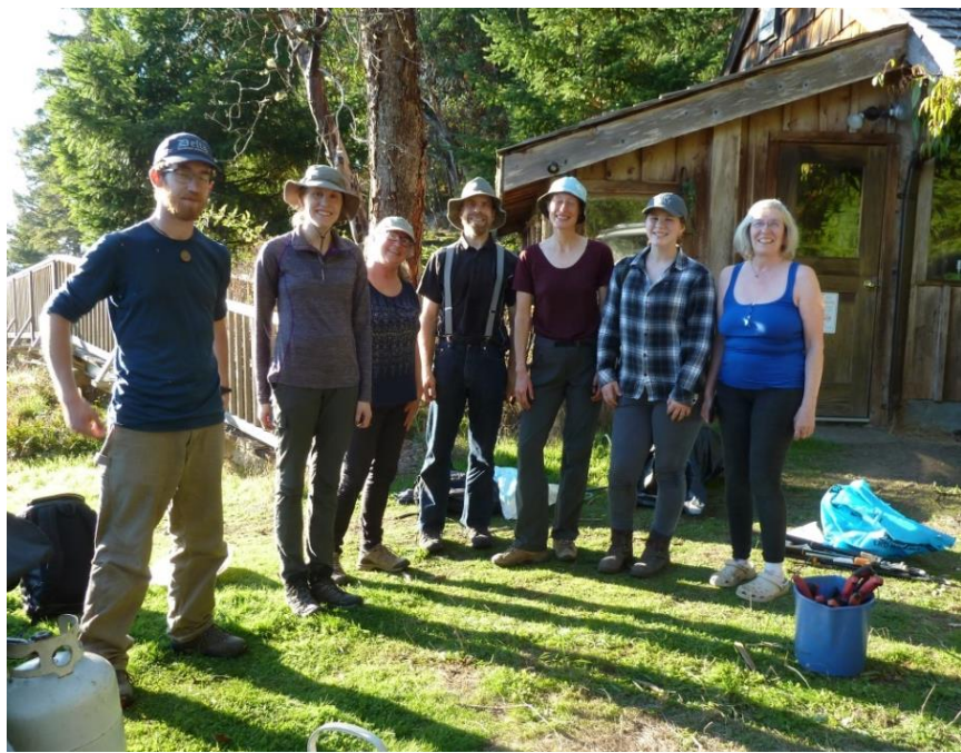
Figure 9. Volunteer group that conducted the invasive species pull on October 20<sup>th</sup>, 2018.

It is clear that long-term management will be necessary to control Scotch Broom in all areas of the TNS. Specifically to completely remove Scotch Broom from the bluffs it would require a team to rappel down the cliffs and remove it with the proper safety equipment which we did not have access to or the training for.