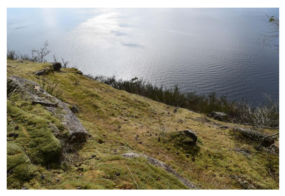
Figure 10. Scotch Broom growing on the step edges of the bluffs.