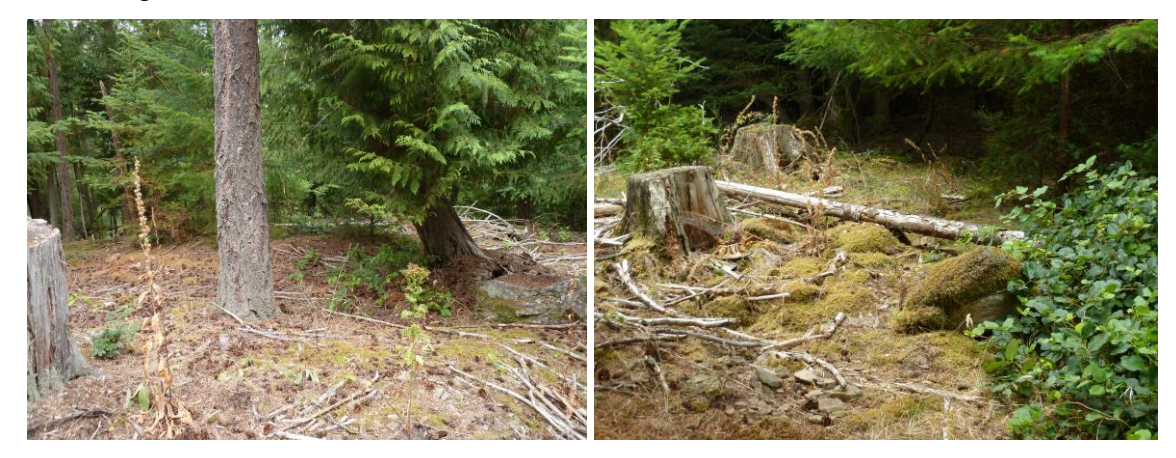
Figure 6. An example of the photo monitoring data from Transect 9. Photos are of data point F12 (See Appendix 1 for complete data information). Photo on the left was taken facing North and the photo on the left was taken facing South.

Photo monitoring took place between July and October of 2018. Photos were taken at all points where invasive species were located (Figure 6). A GPS waypoint was recorded with the photo number and the direction the photo was taken was documented. Photos were taken using a Panasonic point and shoot camera. Photo monitoring was done to provide a baseline for HAT in areas where they have not started removing invasive species yet. This will allow HAT to see what each site looked like in 2018 for future studies and management. See Appendix 1 for all photo monitoring data.