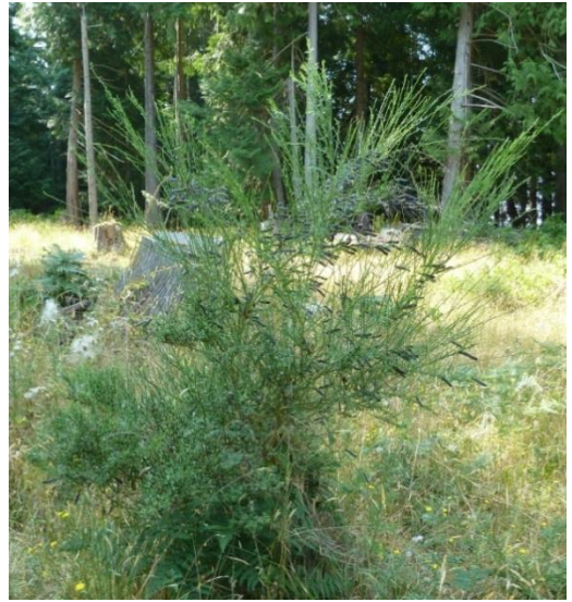
Figure 12. Scotch Broom with seed pods.

Scotch Broom is a deciduous shrub that can grow up to three meters in height. Flush (seedlings) are green and spindly whereas older mature plants have more woody stems with green branches. These plants have yellow flowers and the seed pods are a black/purple colour (Figure 12). Scotch Broom is a prevalent invasive species in southwestern British Columbia and is extremely concentrated at the southern end of Vancouver Island. This species prefers open sites and disturbed areas and grows best in areas that have good draining and sandy soils.