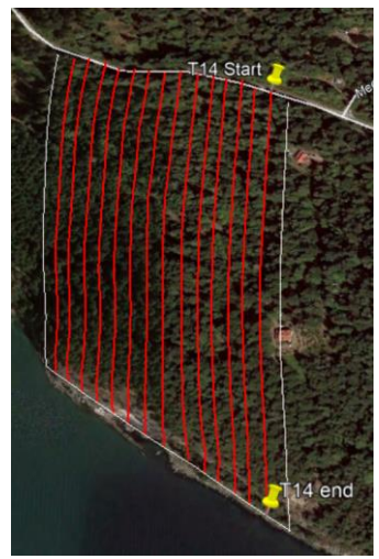
Figure 5. Line transects mapped out 15 meters apart on Google Earth Pro. Transect 14 is selected showing the start and end points.

To begin, Google Earth Pro was used to map out the boundaries of the TNS using UTM coordinates. Then, start and end points for each transect were mapped out 15 meters apart on Google Earth Pro (running north to south) and the coordinates were entered into a Garmin GPS (Figure 5). The GPS along with a compass were then used throughout the TNS to walk along the line transects. While surveying each transect for invasive species, species were marked on the GPS anywhere within 7.5 meters of each side (east and west) of the transect. There were 14 transects surveyed in total (see Appendix 1 for transect data) and one transect (Transect 2) did not have any data points.