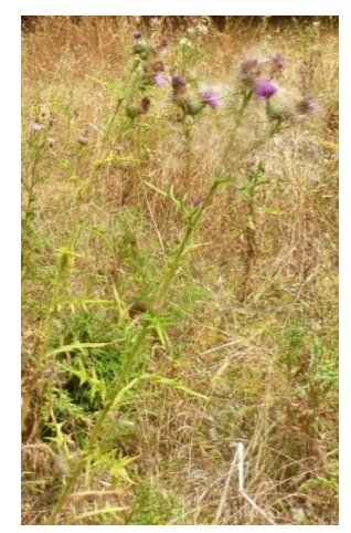
Figure 13. Canada Thistle.

Canada thistle is a widespread invasive species throughout British Columbia. Canada thistle can be identified by its white to purple flower heads (about 1 cm in diameter) in clusters of 1-5. Plants range from 0.3-2 meters in height and leaves are long and narrow with spiny edges (Figure 13). This invasive species can have major effects on ecosystems due to its ability to spread rapidly and form dense patches which causes decreases in native species (Invasive Species Council of British Columbia, 2014).