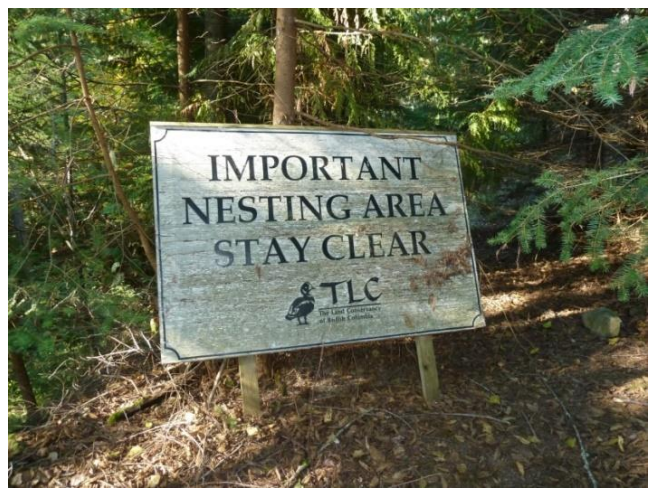
Figure 3. The Land Conservancy sign warning people to stay clear of important nesting areas in the TNS.

Before this project began permission was granted by HAT and the Island Land Trust to perform restoration as well as conduct vegetation surveys in the TNS. Due to the TNS being an important nesting area for avian species, especially along the coastal bluffs, data was only permitted to be collected in the northern section of the Sanctuary in July and August as to have a minimal effect on the nesting birds (Figure 3). Once avian nesting had ended data was collected in the southernmost portion of the sanctuary in October (Figure 4).