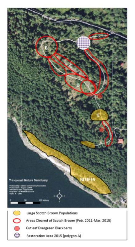
Figure 7. TNS map of where Scotch Broom was targeted for the invasive species pull on the southern bluffs.

and thrown off the bluffs into the ocean as the terrain and remoteness of the location made taking the plants off site for disposal not possible.