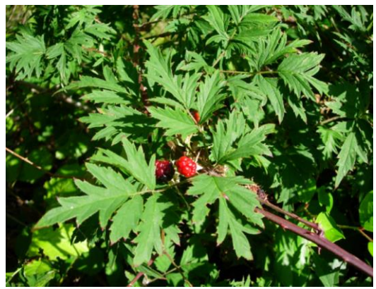
Figure 16. Cutleaf Evergreen Blackberry.

Evergreen Blackberry, also referred to as Cutleaf Blackberry is a European species that was introduced for fruit production and has become a highly invasive species that is difficult to control (Figure 16). This species has an extremely deep root system which can make management a long process.