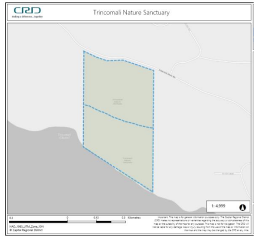
Figure 4. The TNS divided into two segments for data collection. The northernmost half of the TNS was surveyed in July and August and the southernmost half of the sanctuary was surveyed in October.