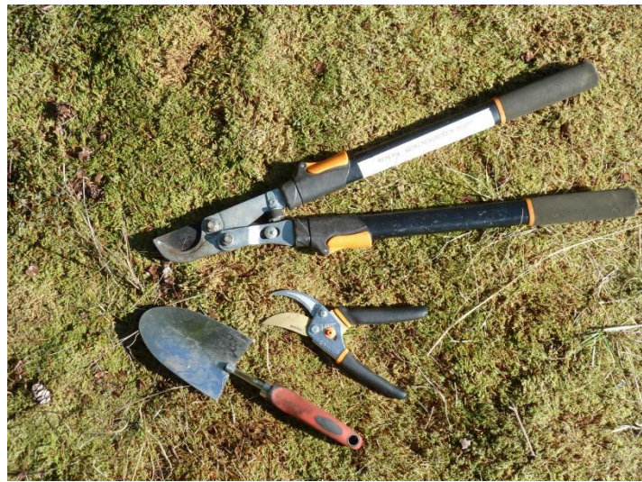
Figure 8. Some of the tools used during the invasive species removal event.