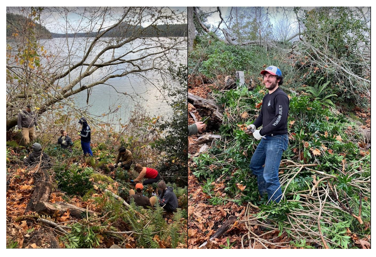
Figure 3. Volunteers during November 2023 invasive plant removal event. UVic ERC volunteers hard at work (left). Debris pile of removed spurge laurel with volunteer (right).

In addition to the above, 20 hours of invasive species management was done by a maintenance contractor (see methods section for details). The total people-hours spent on this site by volunteers and paid staff conducting invasive species management was 174 hours over the course of my involvement in the restoration project.