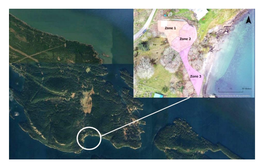
Figure 2. Location of Shore Access 17 restoration site on Galiano Island, with management zones delineated in inset map.

The restoration site is in the semi-arid Coastal Douglas Fir biogeoclimatic zone (CDFmm) which occurs on parts of south-east Vancouver Island, the Lower Mainland of B.C., and the Gulf Islands within the rain shadow of the Vancouver Island and the Olympic peninsula mountains (Nuszdorfer, Klinka and Demarchi, 1991). Vegetation of the CDF ecosystem includes 50 rare species, many at the northern end of their distribution. (Nuszdorfer, Klinka and Demarchi, 1991). Galiano Island has a warm-summer Mediterranean climate (Csb) under the Köppen climate classification system, with a cool and wet winter (Climate Data, 2024).