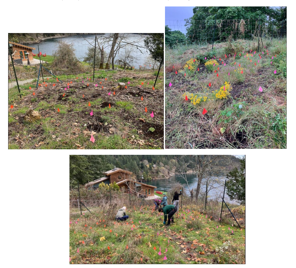
Figure 4. Southern end of Zone 1 through the seasons. April 2023 (top left), June 2023 (top right), November 2023 (bottom middle).

There are limitations to the collected monitoring data. The methodologies used in April 2023 and September 2023 were different: April 2023 monitoring was done for all three zones using the mapping application Avenza to create geospatial point data at each seedling, including a health score for each plant, while the September 2023 monitoring was a simpler presence/absence census of Zone 1. The time of year when monitoring activities were conducted is also relevant when analyzing these data – certain early-flowering plants (i.e. great camas) would have senesced by the September monitoring. Other species would not yet have germinated during the April monitoring (Figure 4). Plants for this site were specifically chosen to have a wide variety of flowering times, so there isn't one time of the year where monitoring would catch all plant species. This means that the data should be looked at as a suite to create a more complete picture of the success of native plantings at the site.