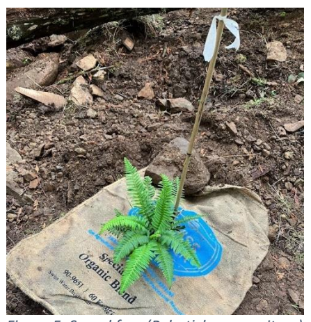
Figure 5. Sword fern (Polystichum munitum) planting with burlap (above). Caged native planting with Himalayan blackberry inside cage (below).

There are 36 native plantings in Zone 2 that are surrounded by individual cages to protect them from deer browsing. All of the plantings need maintenance through invasive species removal as the cages protect invasive species from deer browsing as well, and the plantings are becoming crowded. Initial monitoring shows that 27 of the plantings need replacement plantings, which is a 25% survival rate; however, the native plantings may continue to survive while being covered and crowded by invasive species. I suggest that first, invasive removal is done by a knowledgeable labourer, then second, the number of replacement plantings needed is confirmed. When those are put into the ground, I suggest to replant with burlap surrounding them (Figure 5) to avoid competition from invasive species.