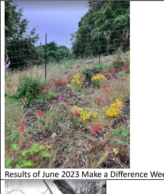
Results of June 2023 Make a Difference Week invasive removal efforts