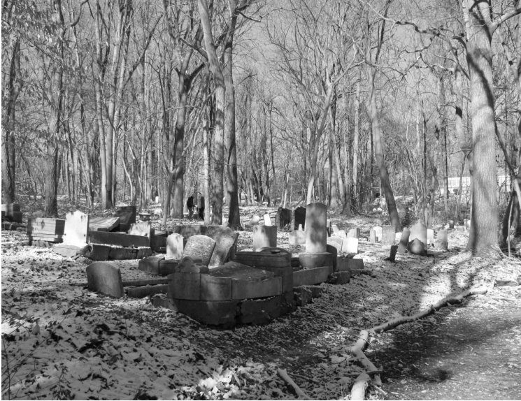
Figure 1. Har Hasetim, Gladwyne, Pennsylvania, 2016.