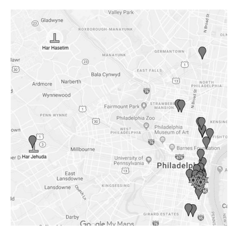
Figure 4. The location of Har Hasetim and Har Jehuda, in relation to Jewish synagogues and benevolent societies in Philadelphia. During the early twentieth century, the Independent Chevra Kadisho (I.C.K.) managed both cemeteries.<sup>27</sup>

The second map shows the location of Har Hasetim and Har Jehuda in relation to the city of Philadelphia, where the cemeteries' residents once lived. These images show the vibrant society packed into the Jewish Quarter and speak to the potential of user-friendly, open-source platforms that historians can use to make interactive materials for local history projects.