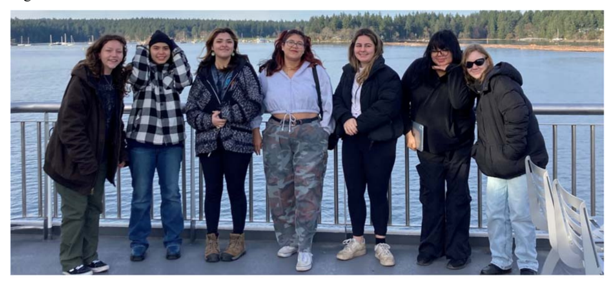
Figure 7. The INVINCIBLE Crew

My personal experience is that youth in care don't have a lot of opportunities to do things like this. These opportunities don't come often, unless we're lucky enough. So we want to share with other youth that you can do this, we have a lot to say! Even if you were not given the best hand in life and you didn't have a good start, there are opportunities out there like this, and a lot of us are doing really great with our lives and we have success. We want other youth to know that we are creative, we are storytellers. We want them to feel empowered to be loud and let everyone know that we're still here! And we're awesome!!