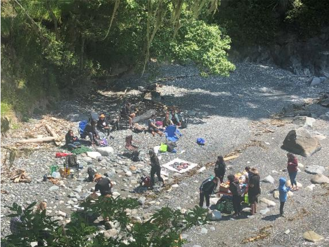
Figure 1. At Spirit Bear Art Farm

Note. Gathering on the beach to share wild rose and fir tip tea in T'Sou-ke territories.