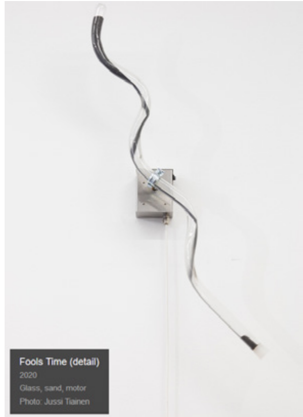
Fools Time (detail) 2020 Glass, sand, motor