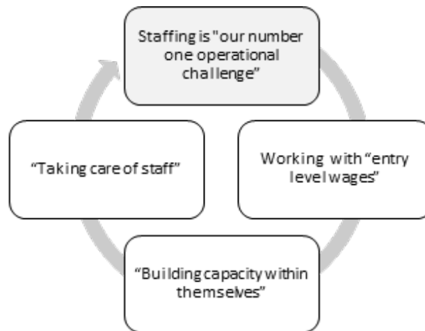
Figure 3. Summary of subthemes in staffing is "our number one operational challenge."

reported having staff in their programs for 10 years or more, and other participants described not being able to keep staff beyond two years. These different experiences may relate to the data discussed in a later section, on the ability of programs to support staff's ongoing professional development and well-being and a living wage. Regional variations may also account for different experiences in recruiting and retaining staff. For example, in the lower mainland of BC, ECEs are more mobile and have multiple employment options. Recruiting and keeping ECE staff in this region and job market may therefore be more challenging. Nonetheless, a recurring theme in the data identified that "our number one challenge operationally is staffing" (P16). Or, as the following participant pointed out, "the biggest issue is qualified staff. Previous governments have said we're going to invest money and build new spaces. You can build the building, you can fill it full of children, but you cannot staff it" (P18). Within this broad theme, analysis of the data identified three interrelated subthemes, summarized in Figure 3 and discussed in the following section.