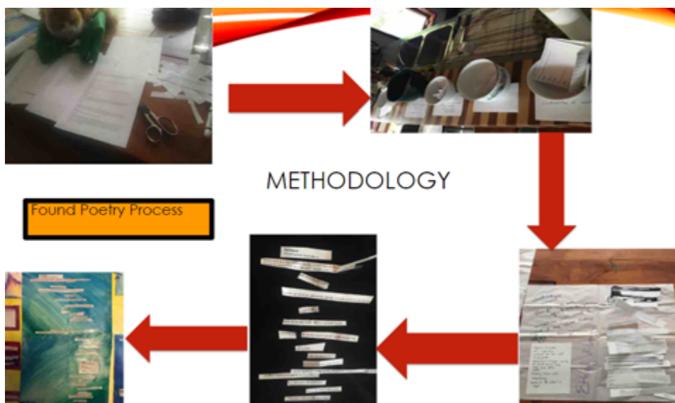
Figure 1. A simple diagram showing the poems in progress during the stages of composition.

While the collection of poetry offers a considered response to this question, it refuses any clear answers. In a previous coauthored methodology paper, "The Poetics of Brittle Bone Disease," we discussed the slow, intentional creation process of the found poems and situated qualitative themes within the greater discussion of childhood bioethics (Cleary et al., 2022). Much like how one would cut up pictures in a magazine to make a collage, different parts of research interview transcripts were cut and pasted to compose these found poems. In this case, the first author intentionally hand-cut pieces for each of the found poems from our research team's extensive interviews with children with OI and their siblings, families, and clinicians and accompanying research field notes (Wang et al., 2022). Each word, line, space, and punctuation mark was painstakingly selected to communicate emergent research themes within their emotive matrix and contained by the aesthetic logic of poetry (see Figure 1). In this article we share all of the created poems to be engaged directly as the works of literature that they are.