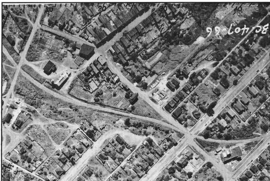
Figure 5. 1947 Air Photo showing a portion of Chinatown. Intersection of Pine and Hecate streets in upper left centre

terial excavated by probe and shovel was screened using a 1/8" mesh. Some surface collecting was conducted and a number of photographs were taken.