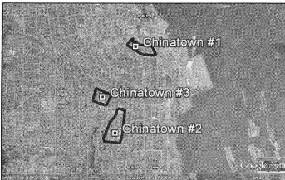
Figure 2. Location of Nanaimo's Chinatowns.