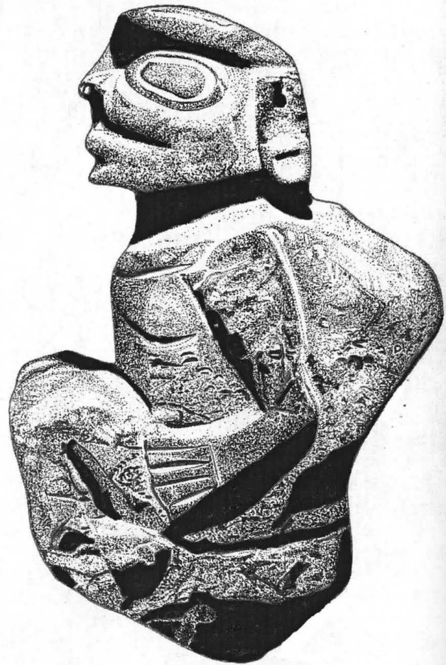
Figure 1. Human Figure [Hump Back Man, Hunchback Man]; drawing by the author.

The location from which the sculpture came is known today