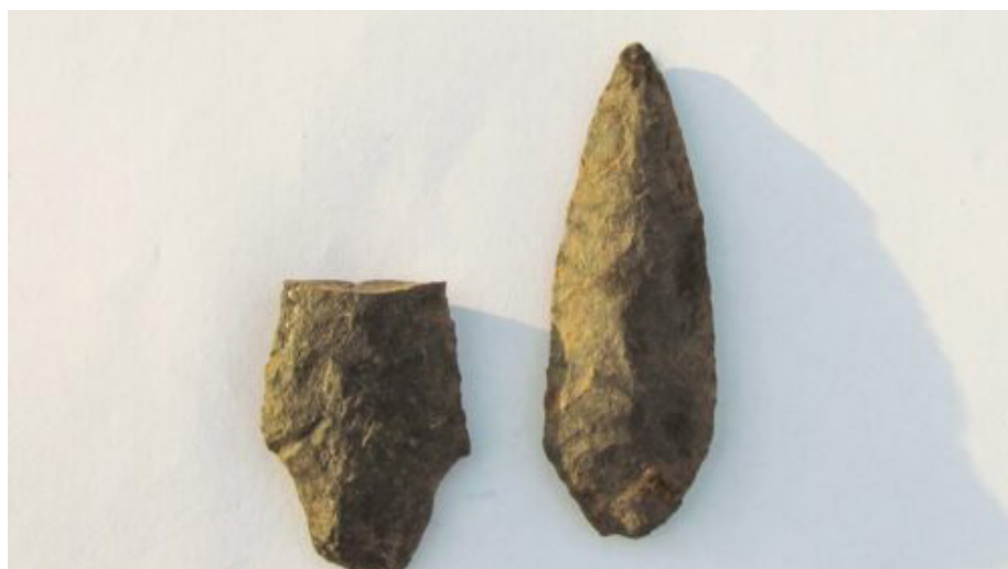
(Figure 1. Unistoten artifacts F. Huson)

A couple of stone tools appearing where a pipeline was planned represent, in microcosm, the challenge of reconciling our occupation on unceded land. We can build on it, we can buy and sell it, we can profit from its resources, but we can't wipe it clean and make it ours. We cannot erase the past.