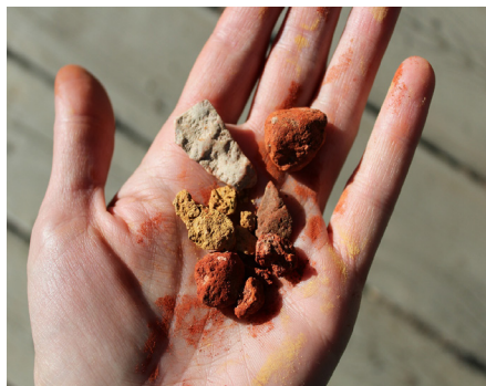
Figure 2. Ochre