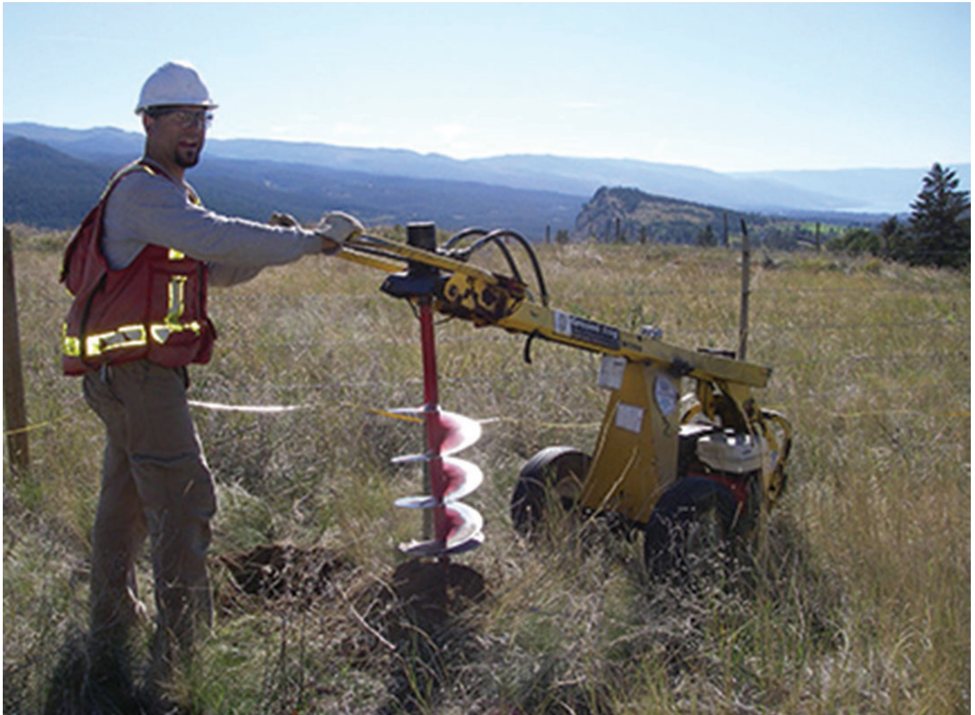
(Figure 3. Todd Paquin Okanagan 2009)

permit-holding status, employment opportunities open up.