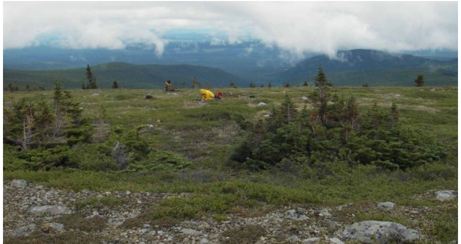
(Figure 2. Recording an archaeological site high in the Northern Rocky Mountains.)

As with much of BC, archeological sites tend to be where archeologists look for