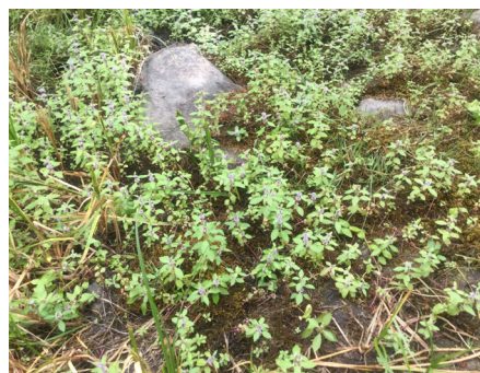
(Figure 2. Fieldmint)

the Interior is more amenable to the preservation of buried plant remains than in more temperate areas of BC. While there is no doubt that plants were important economic resources during pre-contact times, plants are rarely found in archaeological contexts, as organic materials simply decay too fast. One of the most common indirect kinds of evidence for plant utilization in the Kamloops area are small, round cultural depressions, with blackened charcoal-stained soil and fire broken rocks: the remains of ancient earth ovens. Since many of the important edible root species had to be cooked