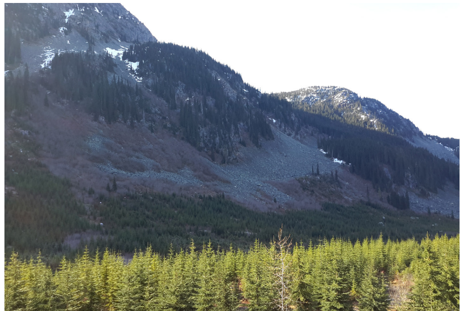
(Figure 2. The Fraser Canyon)

The work is challenging, as many of these areas are extremely remote, and in rugged, high elevation terrain. Based on the results of other Ice Patch Archaeology projects being carried out in other parts of western North America, the cost of completing these