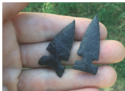
Figure 3. Projectile points