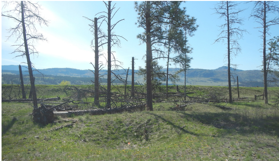
(Figure 2. Multiple circular depressions within an archaeological site north of Kamloops.)

These flooding events also have the power to damage what remain of some the area's earliest First Nations village sites. Many of these early villages, which have become archaeological sites, were built on the very banks of the waterways that are flooding today. And they can be damaged in the same way that houses built on creek and river banks are. An example of this can be seen at an ar-