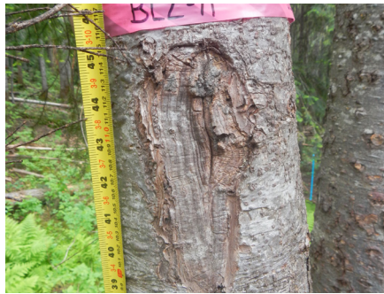
(Figure 1. Blazed tree)

Besides travelling by boat through lake and river systems, travel by foot (and later horses) was the primary means to move around the landscape in the past. Trails networks were used extensively to access resource gathering locations, such as fishing, fur trapping, or berry picking areas, to interact and trade with neighbouring