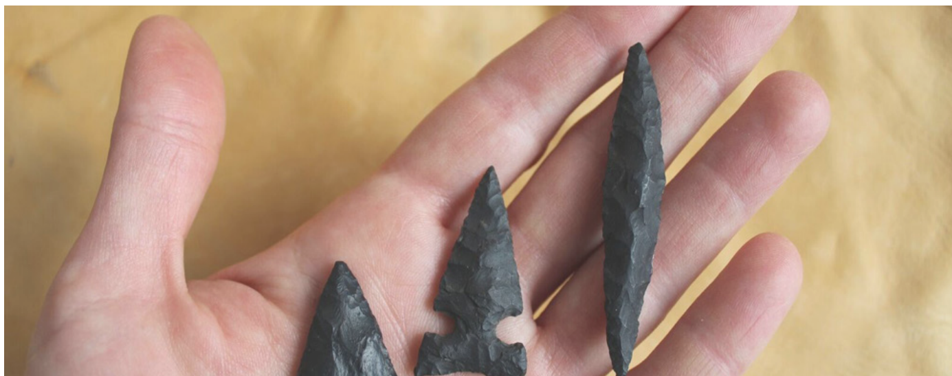
(Figure 1. Examples of chipped stone tools found on the Central Canadian Plateau.)

Archeological research shows the high-quality dacite tool stone collected and quarried from near Cache Creek was traded across the region and beyond -- and this trade persisted over thousands of years. First Nations communities established an interconnected series of pedestrian trails and canoe routes that facilitated regional trade. These trade networks allowed access to important resources that were not locally available. Regional trade and exchange helped