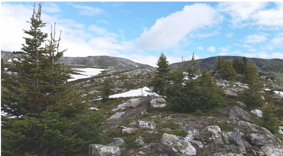
(Figure 1. Archaeological site at Wells Gray Provincial Park.)

There are many other archeological sites recorded in Wells Gray Provincial Park, most during an inventory and assessment conducted in the late 1980s. Four of these sites were found in alpine settings near my find spot. Three of these sites are scatters of stone artifacts and one is a possible petroglyph. The artifact scatters are small and likely represent locations where hunters camped, waited for game or killed and butchered animals.