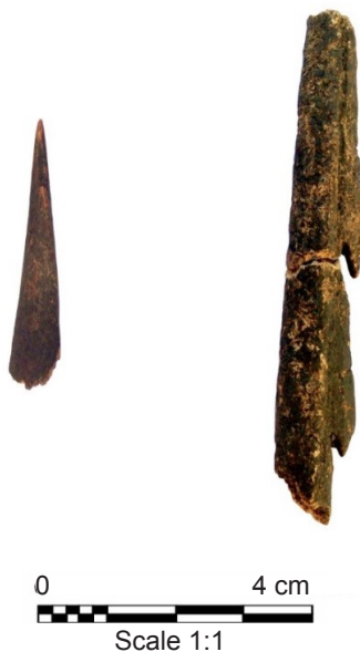
(Figure 2. Harpoon.)

since I am an archaeologist from the southern interior of BC, you think it might be something more than “just another rock.” In isolation, this object does not provide very much information to tie a story to. The story so far, “a little flat rock that might be an artifact” is hardly riveting, is it?