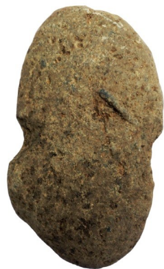
(Figure 1. Photo illustrating a net weight without much background information.)

Imagine I have passed to you the object in the photo and asked you to discuss it. Upon examination, you see that it is a thin, flat, sedimentary rock, about 4 cm by 8 cm, with what appears to be two notches removed from the sides: hardly a ground-shaking discovery. The only real clue is that,