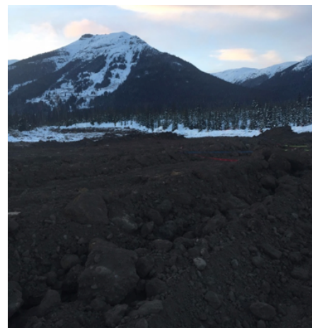
(Figure 3. Disturbed soil at worksite; cleared of forest and Unist’ot’en trapline Feb. 13, 2019)

where the story likely ended for most readers. But this is the beginning of something more damning and troubling for archaeologists across British Columbia. Beyond the OGC’s attempt to discredit and erase Wet’suwet’en people from their territory and deprive them of their cultural inheritance, this story highlights problematic and worrisome gaps in how archaeology is regu-