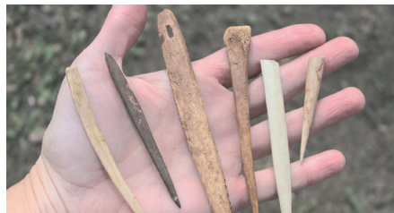
Figure 1. Bone points

In some places, it is the soil. Ten-thousand years of continuous oc-