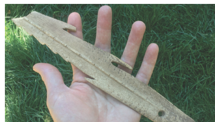
Figure 4. Harpoon head

cupation will do that to a place. How do we know? That's what archeology does — and we're doing that in Kamloops.