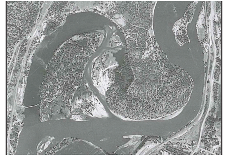
(Figure 3. 1966 airphoto of the same section of North Thompson River showing a new river channel.)

Digging deeper, I learned that in the late 1940s (during a year of especially heavy rain and flooding... sound familiar?) a small local dam had given way and an enormous flood of water came rushing downhill and slammed into the river