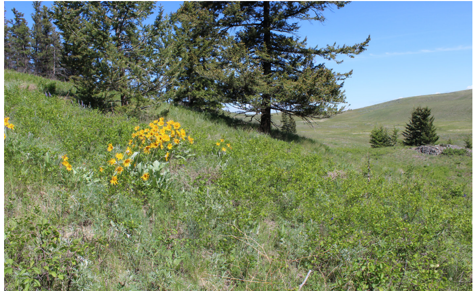
(Figure 1. Patch of balsamroot)

Typically, the study of modern vegetation is associated with traditional use studies that aim to document aboriginal land use patterns. However, field archaeology can at times be an important source of traditional use information, especially where associations between archaeological site types (such as cooking features), and modern vegetation become apparent. While not totally conclusive, it is interesting when it is possible to associate ancient cooking features with an existing patch of a traditionally economically important plant such as arrow-leaf balsamroot. The unique semi-arid environment of