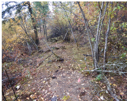
(Figure 2. Portion of the pack trail)

groups, to access important sacred and ceremonial sites, and general day to day travel throughout a region. Travel corridors generally followed a logical route over the most favourable terrain for foot travel through varying landscapes ranging from open grasslands in valley bottoms to steep mountain passes. These trail networks covered distances of thousands of kilometers. In many cases, trees along the trails were marked in various ways in order