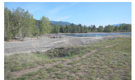
(Figure 4. Photo of the remainder of a cultural depression on an eroding North Thompson River bank.)

Unfortunately, this event also swept away a portion of the archaeological site, which appears to have stretched across the river. Adding to this, the new river channel continues to erode into the bank, and the remaining cultural depressions are being lost to the annual rise and fall of water levels. The unfortunate reality