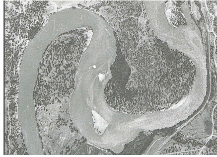
(Figure 1. 1947 airphoto of an oxbow channel on the North Thompson River.)

chaological site north of Kamloops, on the bank of the North Thompson River just downstream from the outlet a large creek. This particular archaeological site is made up of nearly twenty circular depressions of varying sizes; these depressions represent what remain of the village's original pit-house structures as