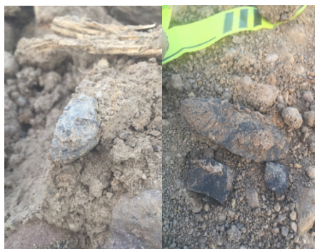
(Figure 1. Stone tools Feb. 13, 2019)

After artifacts were recovered from a disturbed portion of the Camp 9A site and despite endless attempts to contact the OGC and the Branch — the Office of the Wet’suwet’en and Unist'ot'en Chiefs and spokespeople were ignored outright. There was radio silence for almost a month. Wet’suwet’en Hereditary Chiefs and dozens of professional archaeologists endorsed an open letter to the Arch Branch, published in this volume, which outlines concerns and discrepancies with the archaeological