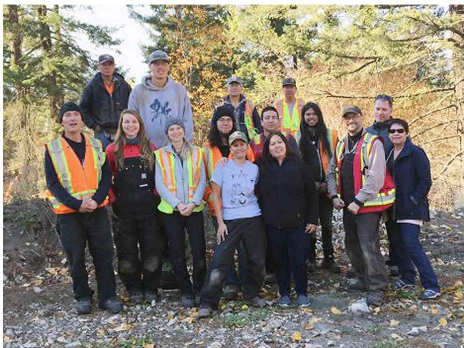
(Figure 1. Little Shuswap Lake Indian Band - Archaeology Team)

There have been some excellent studies completed where the oral history provided by community members have augmented, corroborated, or enhanced the information of the area, practices, events or meaning of artifacts. For instance, we assume designs found on various bone tools is artwork, or a signature design, but we know from oral history that some of these designs were in fact markers that an individual had kept track of the number of items made in their lifetime. In other cases, oral stories passed down through generations that identified a flood or volcanic eruption, which studies completed by Western knowledge also supported the same information, but more excitingly it dated the story more than 4,000 years old. There are many other examples, however the importance here is this kind of information brings together both Indigenous and Western ways of interpreting the past.