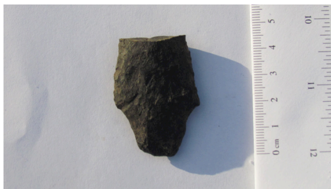
(Figure 4. Biface recovered from worksite Feb. 13, 2019) (Figure 5. Fragment of stemmed point recovered from worksite Feb. 13, 2019)

letin and continued to ignore calls and emails from Unist’ot’en Chiefs. Without investigation, expert opinion, or the slightest inclination of due diligence, the OGC’s carefully crafted insinuation that the artifacts were planted sought to discredit Unist’ot’en people, and simultaneously assert that no archaeological heritage was present nor at risk. CGL could resume construction.