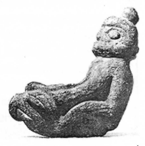
W.Duff 1975 "probably from Lytton"