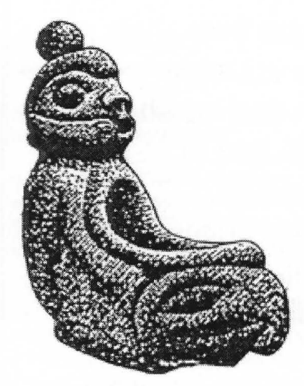
W.Duff 1956 "probably from Lytton"