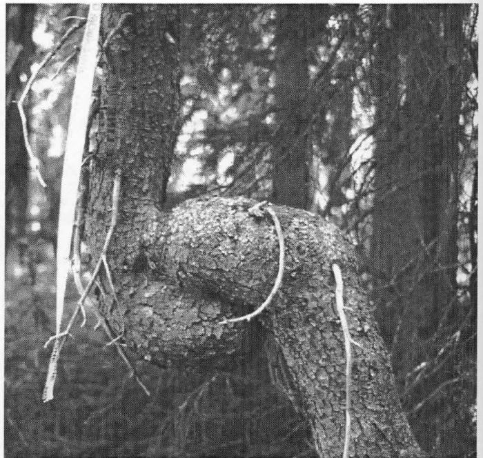
A key First Nation criticism of the current Heritage Conservation Act is that it does not "automatically" regulate a wide range of post-1846 Aboriginal heritage sites, such as knotted trees used to mark trails.

rected CRM projects, and a rapid increase in the number of consulting archaeologists and consulting archaeology firms (Apland 1993; Fladmark 1993). Influenced by CRM developments in the United States, the Branch drafted impact assessment guidelines in 1982 in order to standardize the assessment process for the growing ranks of consultants.