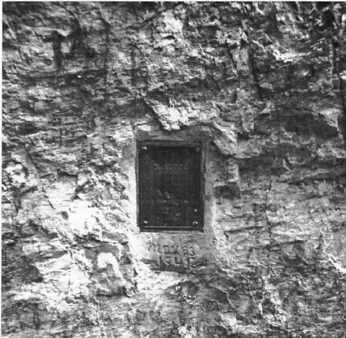
Under the Historic Objects Preservation Act (1925), rock art was explicitly protected, but only if a notice was erected in the "vicinity" of the site.