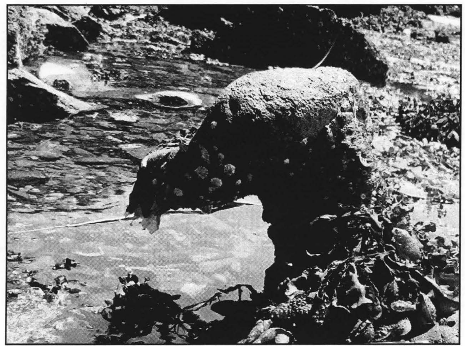
An anchor stone found on the beach in front of one village site. The rock wall was only visible at low tide so Sue Formosa and her mapping crew had to plan ahead and work quickly to avoid being chased away by the tide.

ensuring the transport of the equipment and food needed for a group of thirty people. No small feat considering our field camp was on a small island in the middle of the Dundas region without direct access to fresh water.