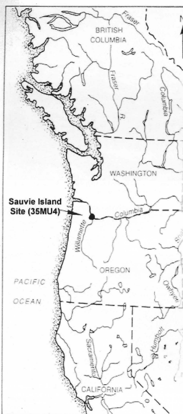
Figure 1. Location of the Sauvie Island site (35MU4) at the confluence of the Columbia and Willamette Rivers in Portland, Oregon, USA.

Preliminary Field Report for Wet Site 35MU4, commonly called the Sunken Village Site,