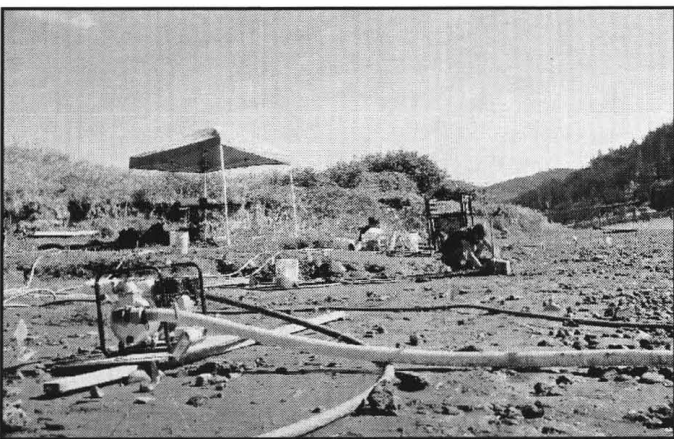
Figure 2. Hydraulic excavation and screening for a two-week, limited evaluation of the National Heritage Landmark Site on Sauvie Island (35MU4). The remaining elevated beach in this area (Transect VI, below TU 1) has the best observed remaining acorn pits and vegetal mat layers (TU 4 is in this remnant beach).

The other in situ features were the wooden stakes, of which 32 were recorded. Two stakes were hydraulically excavated showing that they are long (approximately 1 metre), adze sharpened at their ends, and one had its bark still adhering to the pole. Many of the acorn pits had a stake on their south edge, no doubt marking