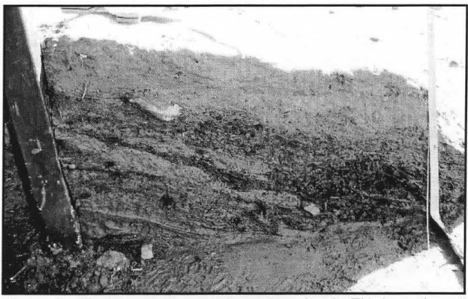
Figure 4. East to west vegetal mat layering in TU 4 south wall showing the accumulation of wood and fiber in sequential layers on the remnant ancient beaches. We were not able to reach the bottom of these deposits. They must exist here because of especially good waterlogging from aquifers coming through these layers from below the natural levee.