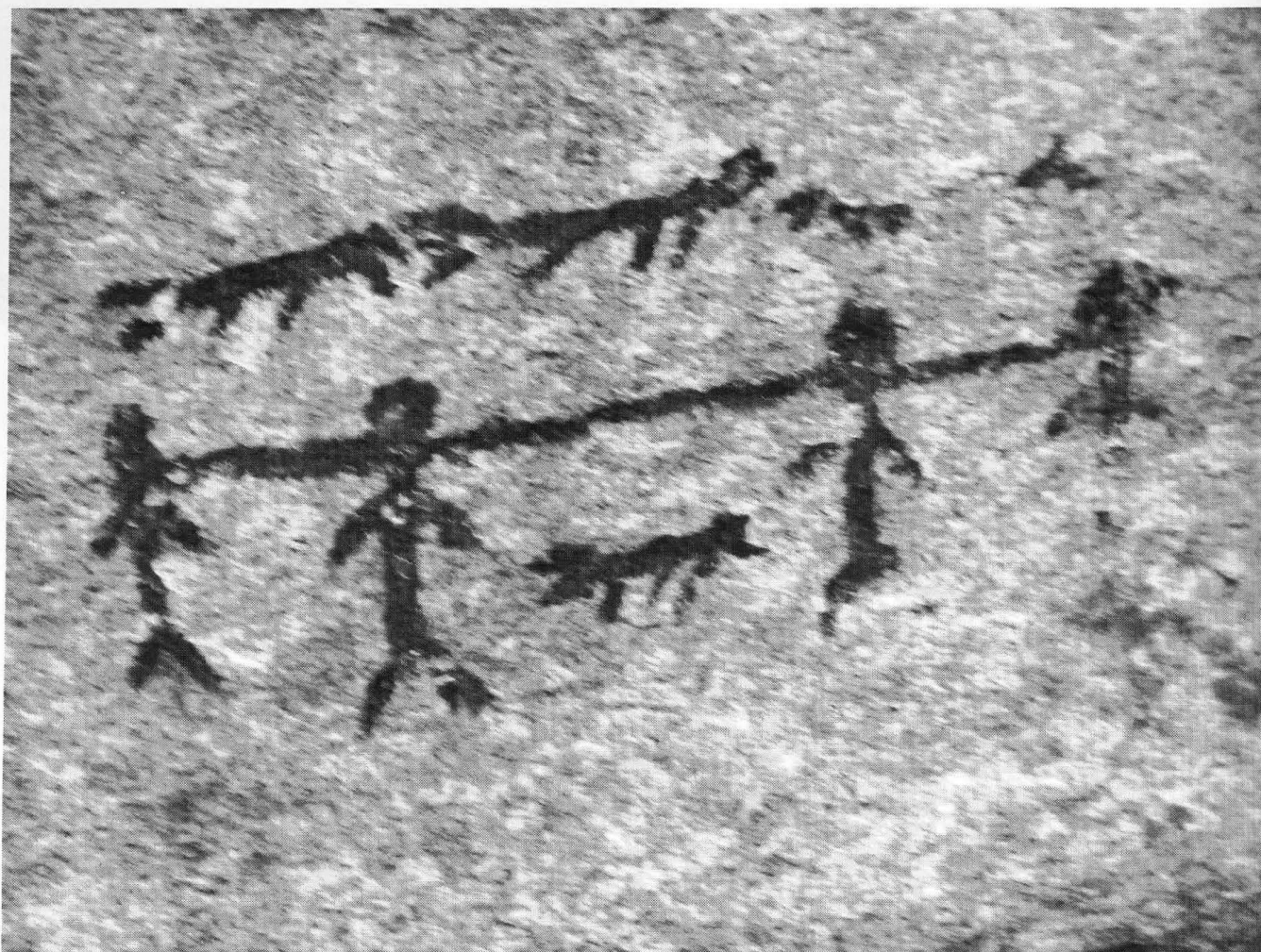
Above: The Prisoner Painting at the Chuchawayha Rock Shelter.

This year I was able to help the Archaeology Department undertake a very important excavation. Lucky for me it was spring break when this job had to be done, so I was able to spend the whole day out there. In August of 2004 there was a whole bunch of mudslides just out of Hedley. The Ministry of Highways was cleaning up the mud off the highway and they accidentally put about 20 or 30 dumptruck loads of mud on a pictograph site. This pictograph boulder had already been almost completely buried in the 1970s by the Ministry of Highways, and, well, they finished it off this time. Luckily the Archaeology Department saw this happening and stopped the dumping before it became a hundred dump truck loads. The material dumped on the site consisted of rock fragments with sharp, hard edges in a soft silty muddy matrix. There was also barbed wire, fence-posts and other nasty stuff mixed in with the debris. In the beginning of the excavation we did not know the precise location of the boulder, and two superficial damages were made to the upper surface of the boulder – but not on top of the pictographs.