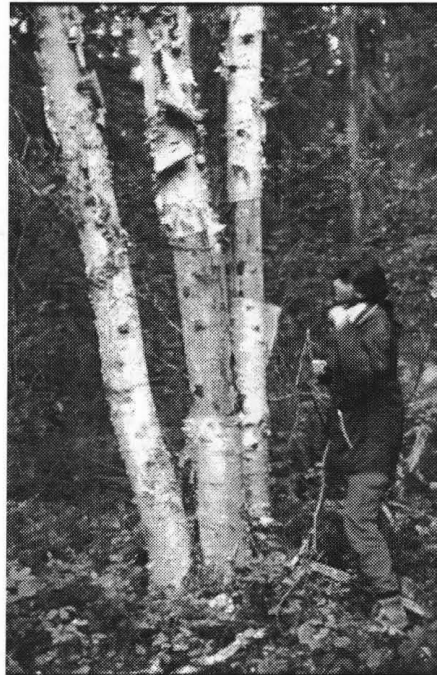
Figure 3. Bark-stripped birch (CMT), Vanderhoof Forest District.

that of culturally modified trees (CMTs) (Figure 3). Three areas of concern have been raised by First Nations. These are: 1) questions about the protection, or lack thereof, offered by the 1846 date in the Heritage Conservation Act; 2) the definition and maintenance of adequate buffer zones around identified CMTs; and 3) apparent inconsistencies in the protection of CMTs between forestry regions in the province.