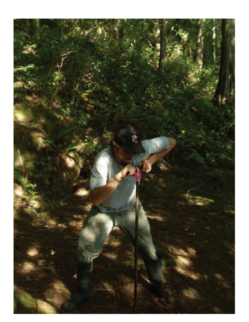
Figure 6 - Letham augers site

sive past settlement and use of Pender Harbour is evidenced by the number of archaeological sites along its shores and its importance in ethnographic records (Barnett 1955; Hill-Tout 1978.) The ethnographically recorded winter aggregation village of séxw?ámin is located about 1 kilometre north of DiSa-48 (Barnett 1955). Our crew identified cultural deposits over 3 meters in depth at séxw?ámin (DjSa-3) under modern buildings. Many of the settlement and camp sites in Pender Harbour, such as DjSa-48, may have been satellites centered on the main settlement at séxw?ámin