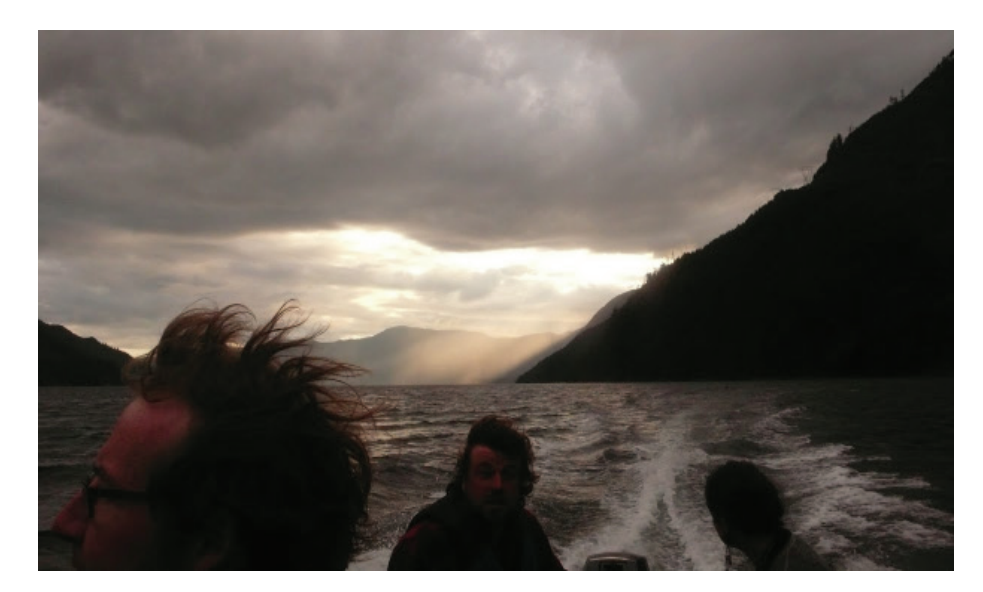
Figure 2 - Coastal survey through Salmon Inlet

practices, in particular the domestic routines of everyday life, make systems of stratification within the region possible? These questions were to be investigated through the following four specific objectives: