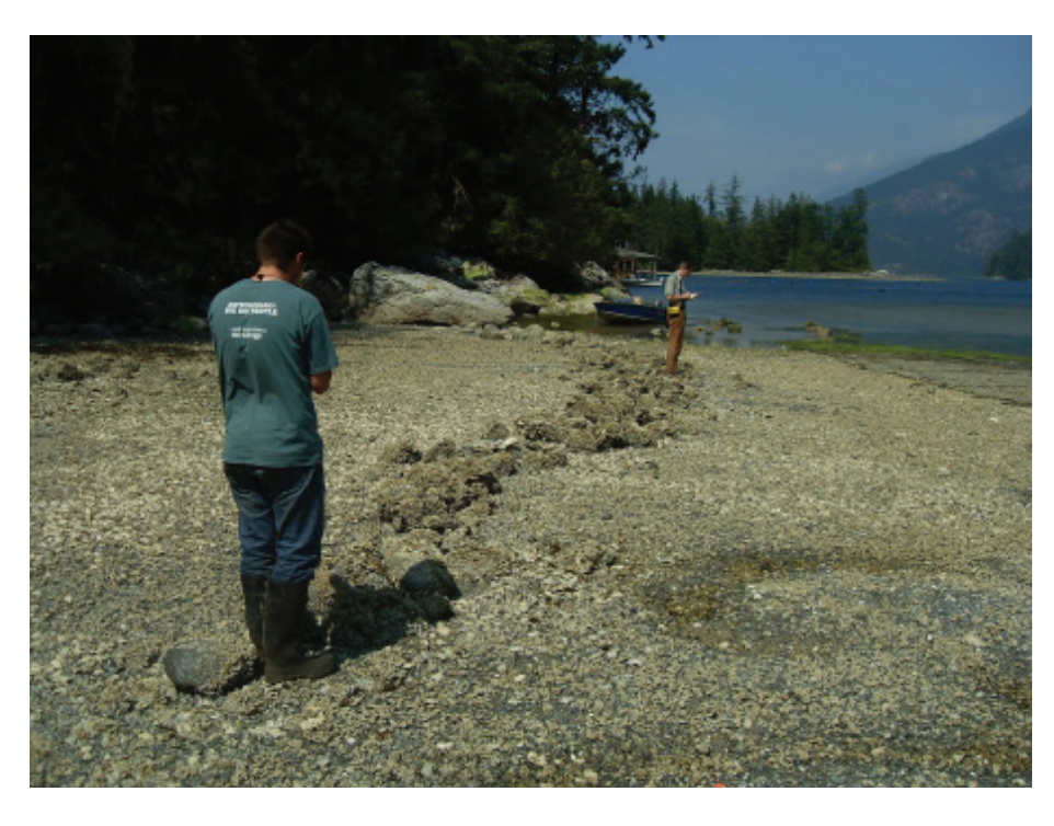
Figure 5 - Stone fish trap in the inlets.

DjSa-48, within the area known as sálálus , is located just west of Madeira Park in the southeastern portion of Pender Harbour. Pender Harbour is a protected series of bays on the outer coast of the Sechelt Peninsula. Radiocarbon dates indicate that the prehistoric component of sálálus extends back