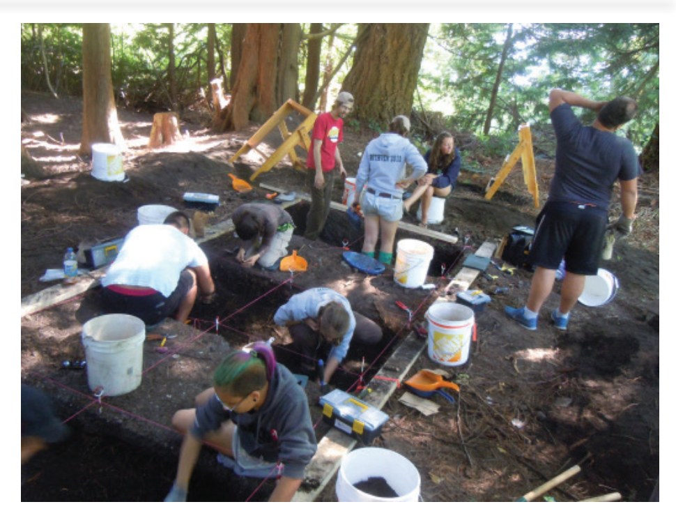
Figure 1 - Shishalh and University of Toronto students excavating at DjRw-1.

The project proposed two basic research questions: (1) how did shishálh hunter-gatherers organize production, both locally at the level of the household, and regionally; and (2) how did social