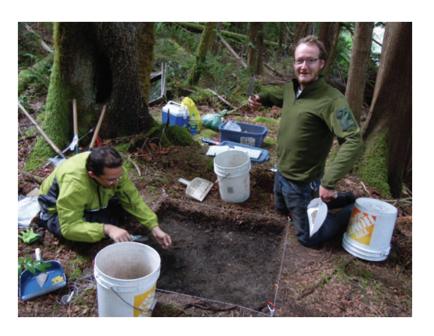
Figure 3 - Test excavations in Narrows Inlet

briefly overviews our field research in the area and reviews key results that are relevant to these research objectives, as well as some that have taken us down somewhat unpredicted research avenues.