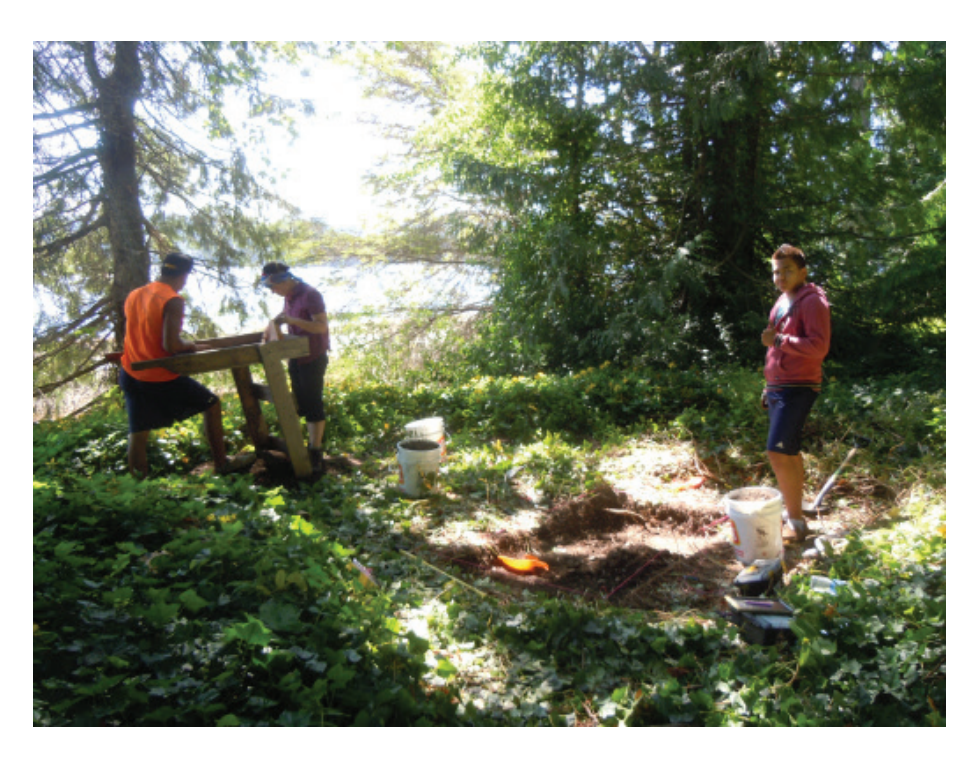
Figure 4 - Porpoise Bay excavation

modern shoreline. Radiocarbon dates indicate that the later occupation of DjRw-1 lasted until about 750 cal. BP. However, the upper layers of this site were leveled in modern times and it is entirely possible that the site was occupied right through into the colonial period. Artifacts were not abundant, but were typical of the archaeological cultures represented in the Salish Sea region (e.g., Matson and Coupland 1995).