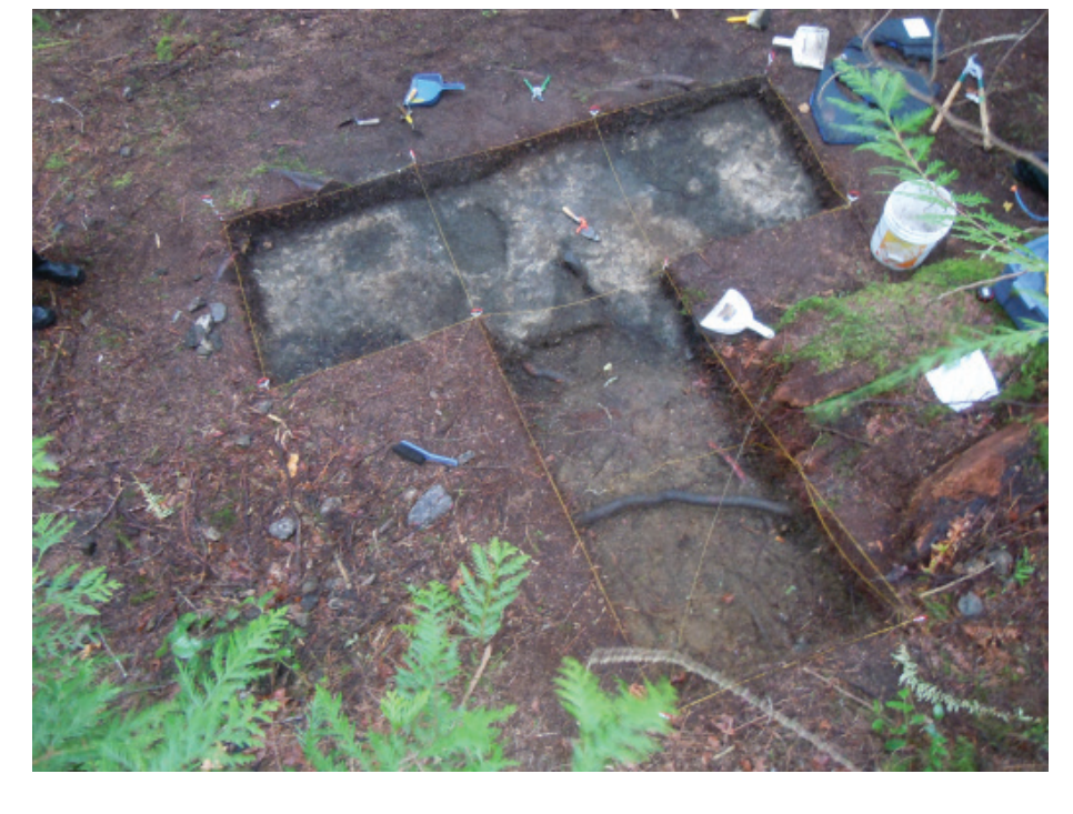
Figure 7 - Test excavation, Narrows Inlet

in many cases). We selected each for excavation because they had rectangular terraces visible on the surface topography that we hypothesized could be house platforms; the sites were likely small seasonal villages with ~3-6 small houses. In six 1 m<sup>2</sup> units at DkRw-22 we found a hard-packed, clean, flat surface consisting of ash and burnt crushed mussel shell that covered a wide area that we interpret as having been a living surface inside of a small structure. In a single 1 m<sup>2</sup> excavation at DkRw-26 we found several small (<1 m) circular depressions filled with this distinctive ash and burnt crushed mussel that were stacked on each other and surrounded by