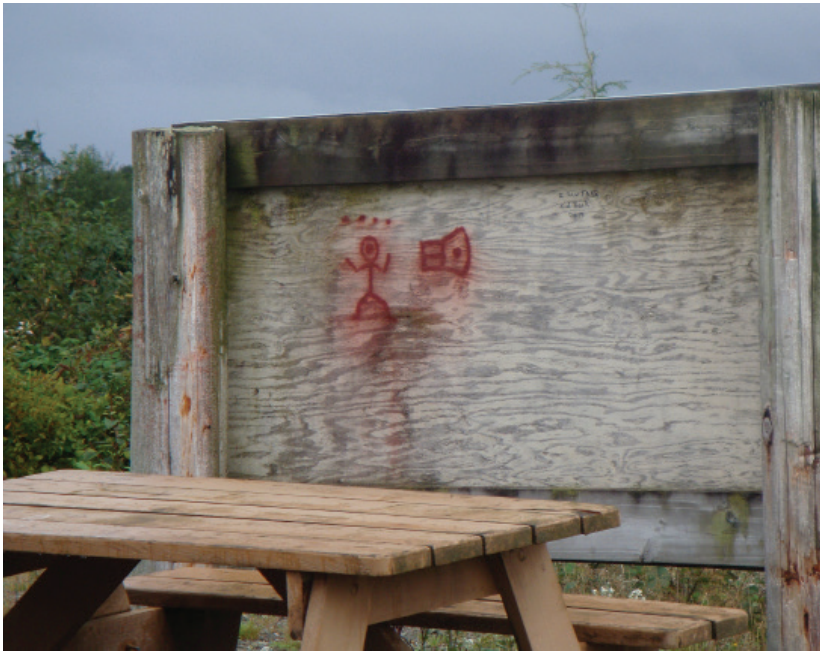
Figure 7: Spray-painted design outside Bella Bella Airport.

evident in both communities which participated in this research project. For example, while material has changed to spray paint in some cases, a design I saw outside the airport in Bella Bella reminded me of this continuity of design. It seems taken straight from the corpus of images also used in rock art of the area, reimagined with contemporary materials.