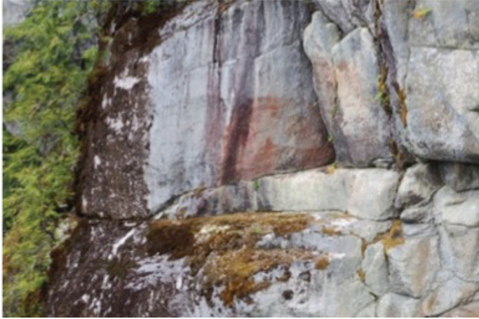
Figure 4: FcSx-5, grouping #3.