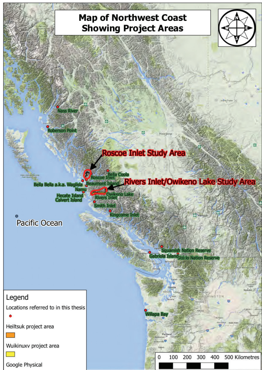
Figure 1: Map of MA study area, Roscoe Inlet and Rivers Inlet/Owikeno Lake. Created by Aurora Skala using Google base layer in QGIS.

This research focused on documenting petroglyph and pictograph sites, using GPS and high resolution photography (which were then post-processed to bring out images not visible with the naked eye). DStretch, a plugin, created by archaeologist and rock art researcher Jon Harman (Harman 2013), was used to do this.