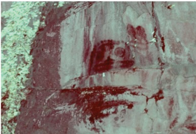
Figure 5: FcSx-5, grouping #3, with DStretch applied.

include this area. She had to rely on others' reports and sketches. She did not get to see photographs of many of the sites in these two study areas until I began this project. Additionally, Beth and Ray Hill's work (Hill and Hill 1974) recording petroglyphs did include a couple of the Roscoe Inlet petroglyphs. Roscoe Inlet and Owikeno Lake have more pictographs than petroglyphs. The petroglyphs in Rivers Inlet, though known to the Wuikinuxv community, were not recorded as archaeological sites until this project. Therefore the Hills' project only provided direct information on 2 of the 58 sites.