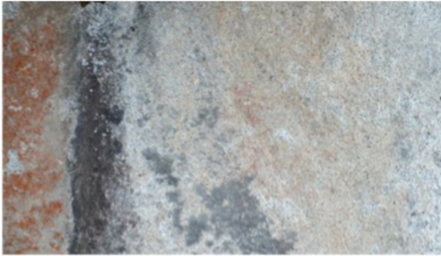
Figure 2: EkSr-11 (recorded as a site during this research).

sites within the study area to be recorded during this study. Community members have retained knowledge of sites which have not been visited by archaeologists. During previous time spent on the Central Coast, I have recorded rock art in locations where it had not been reported. It was found because we were in areas not frequently visited.